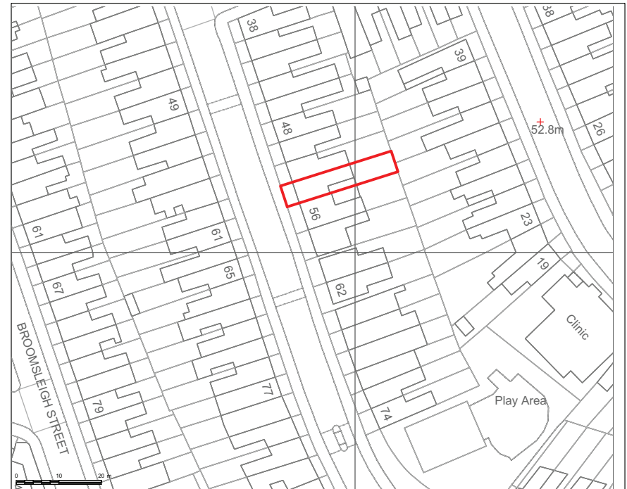
SITE PLAN 1:1250