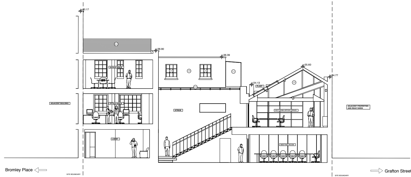
Elevation / Section AA