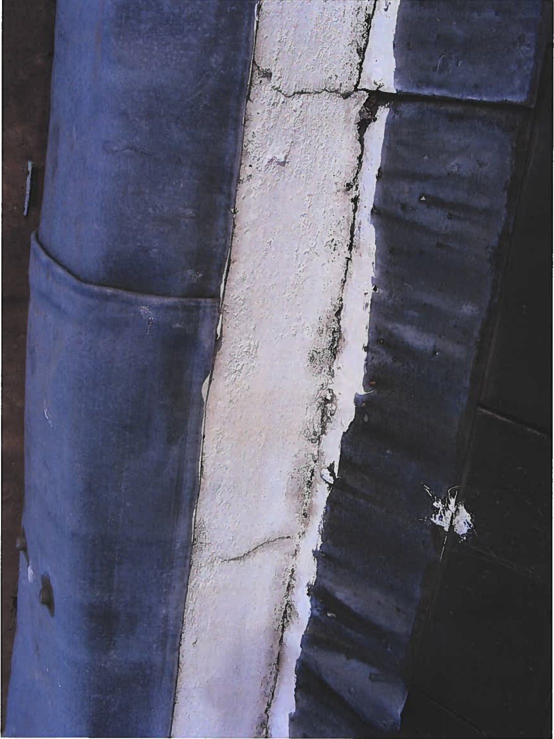
CLOSE UP OF ROOF RIDGE DETAIL. THIS IS TYPICAL ON THIS ROOF.