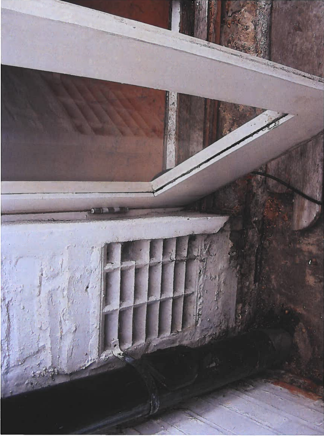
OUTSIDE VIEW OF THE CORNER AT EAST JAMB OF REAR PATIO DOOR PER LOCATION SEE DRG REC012