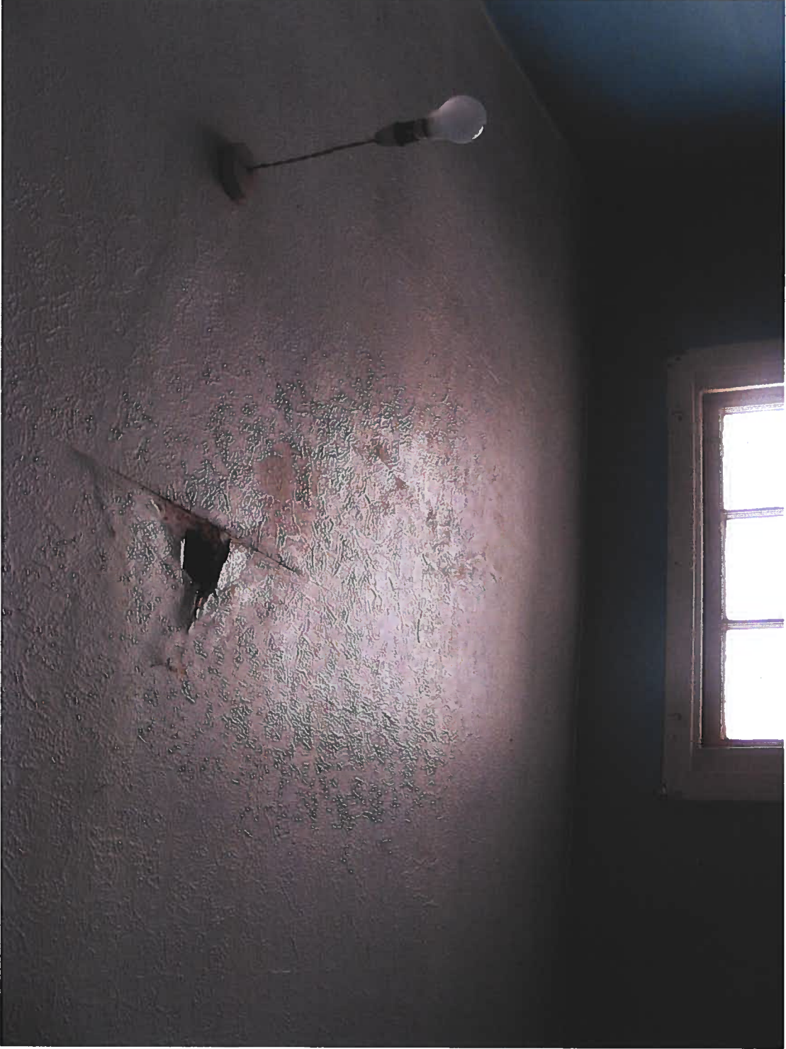
BED ROOM 1 CEILING SEE DRG RE 012 FOR LOCATION.