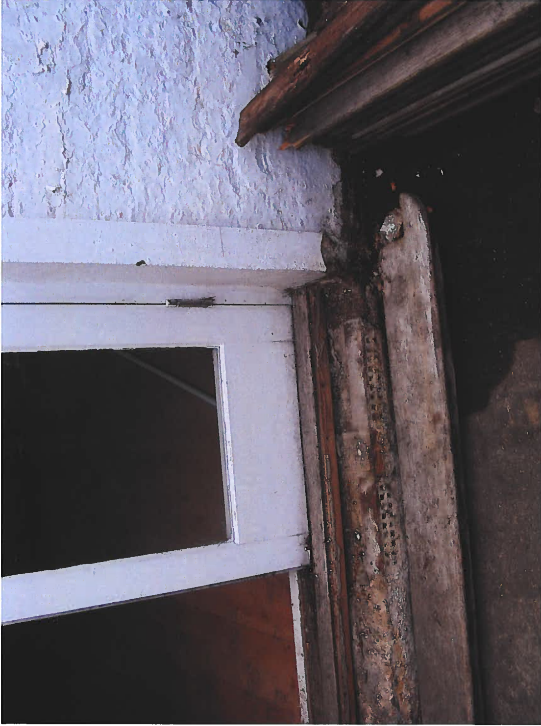
OUTSIDE VIEW AROUND WEST JAMB OF REAR PATIO DOOR