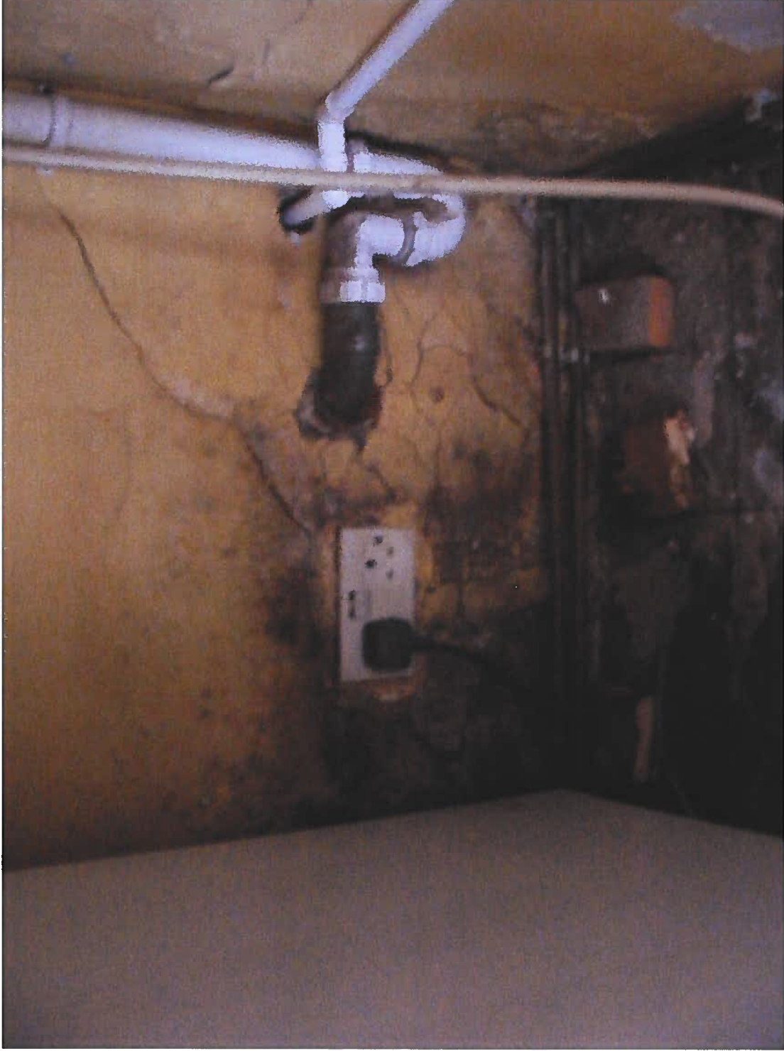
NORTH WALL OF REAR EXTENSION ROOM WALL/FLOOR INTERFACE. DAMP DAMAGE TO PLASTER. SEE DRG. RE 012 FOR LOCATION