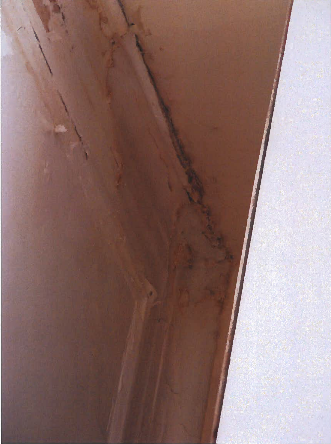
CRUMBLING CEILING COVE IN BEDROOM 2 SEE DRG. RE 012 FOR LOCATION