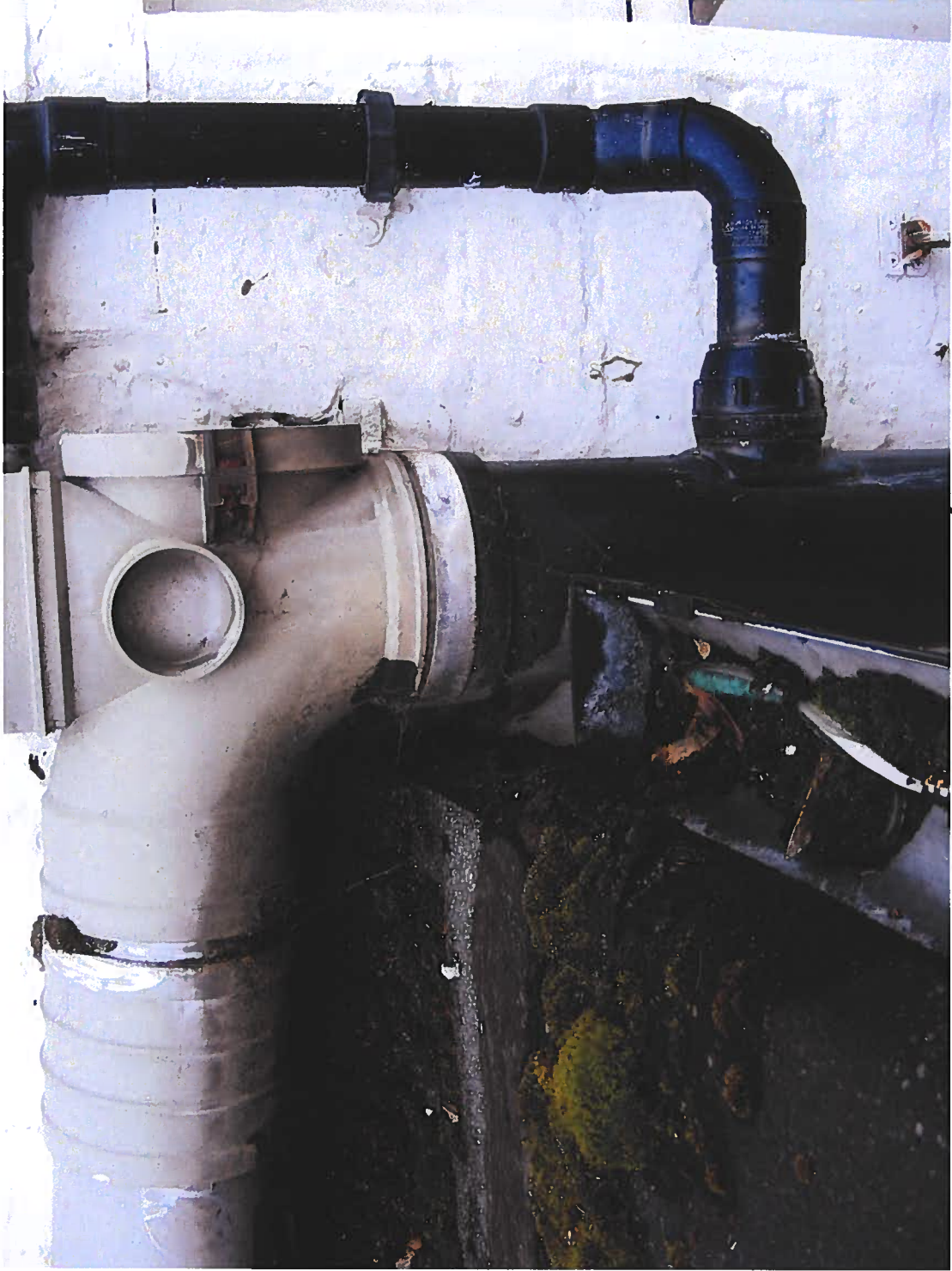
CLOSE UP VIEW OF DRAINAGE PIPES / REAR EXTENSION ROOF AND GUTTER INTERFACE