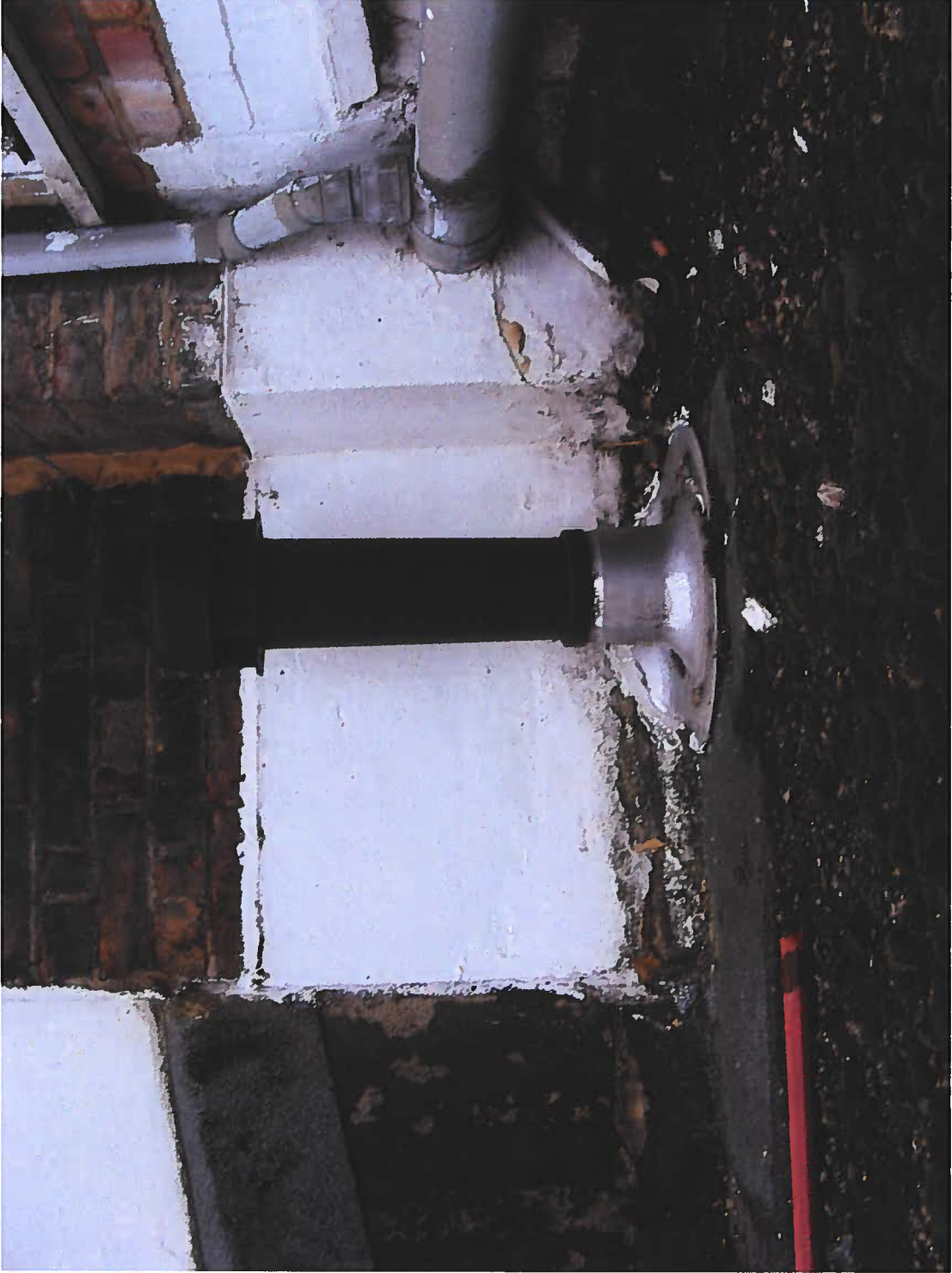
CLOSE UP VIEW OF REAR EXTENSION ROOF, WALLS ABOVE, BOILER FLUE AND DRAINAGE PIPES.