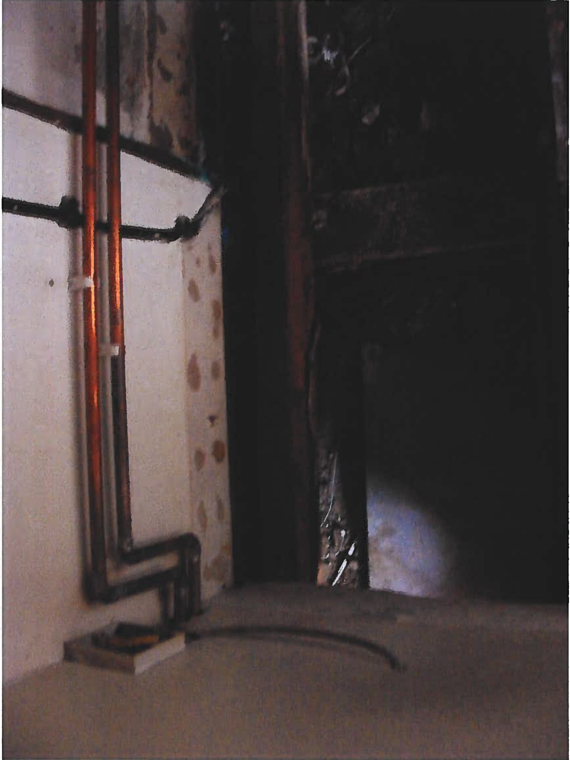
LOOKING ON TO FLOOR IN MEEXERCUPBOARD SEE DAG REQ12 FOR LOCATION