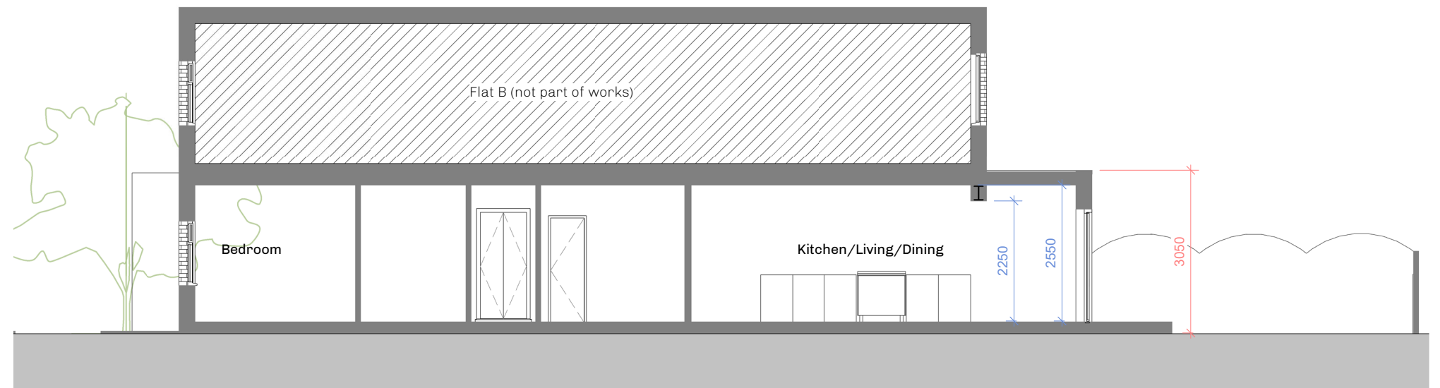
3 Proposed Long Section 1 : 100