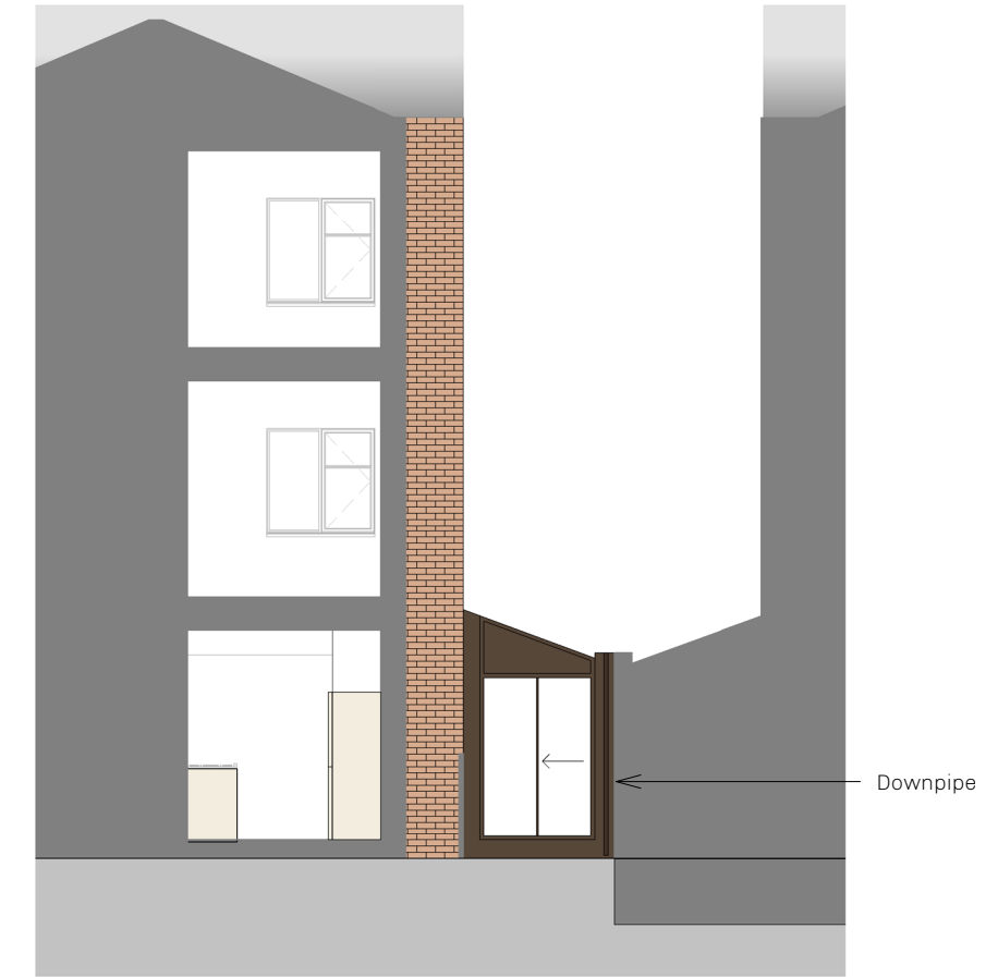
4 Proposed Courtyard Elevation 1 : 100