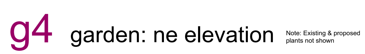
g4 garden: ne elevation

Woollacott Gilmartin 15a Parliament Hill London NW3 2SY wgarchitects@mac.com woollacottgilmartin.com