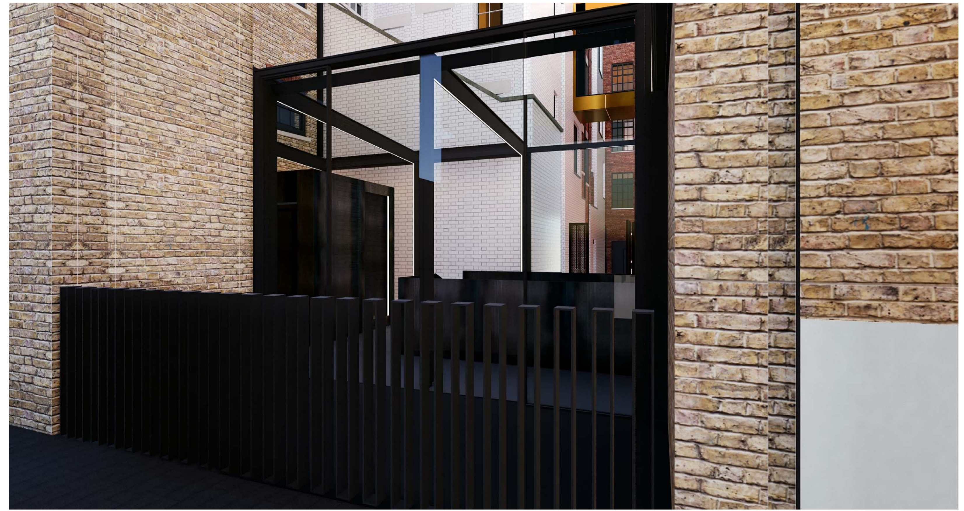
5 Proposed Boundary Treatment Perspective Scale: NTS