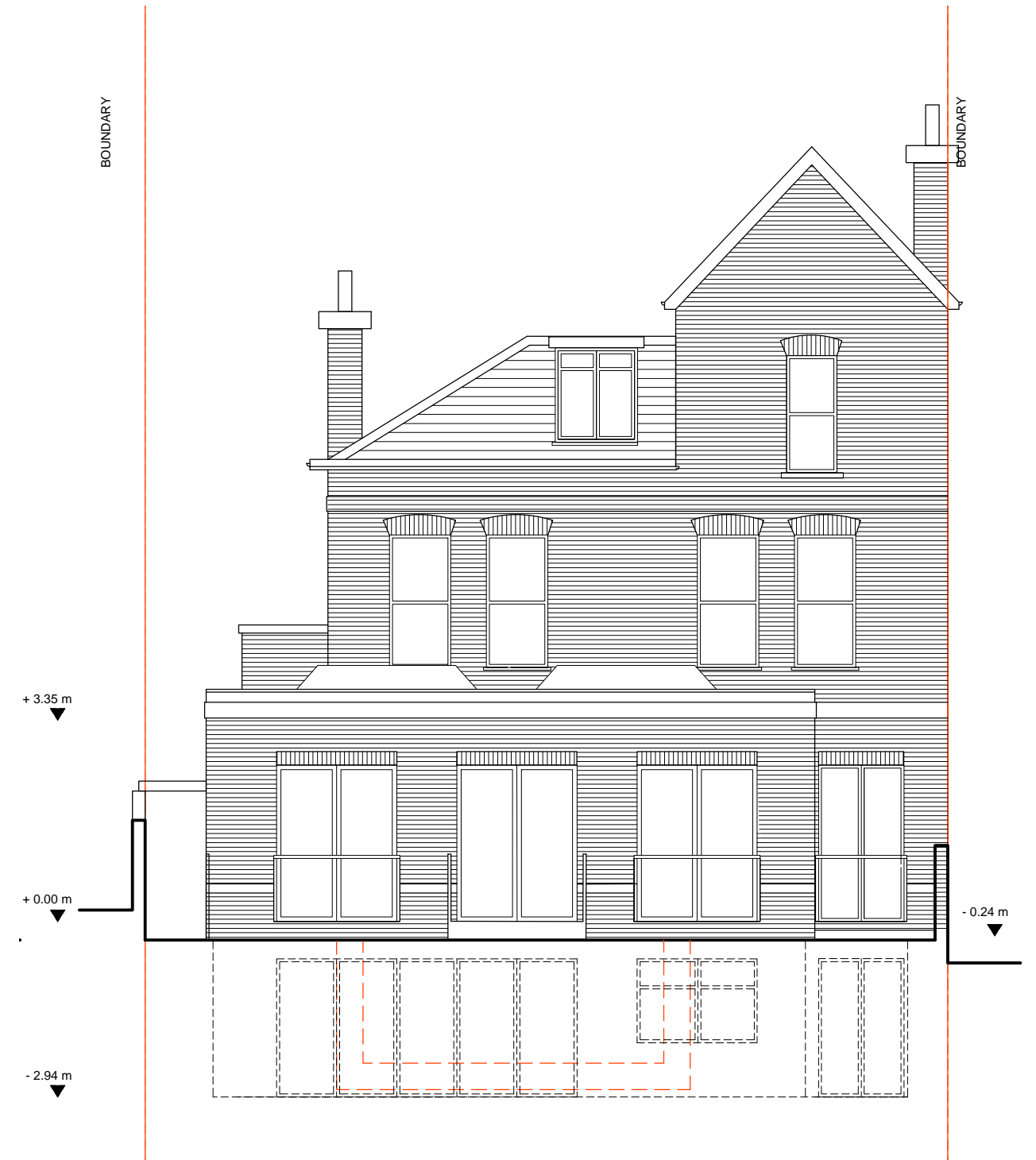
2 REAR ELEVATION - PROPOSED Scale: 1:100