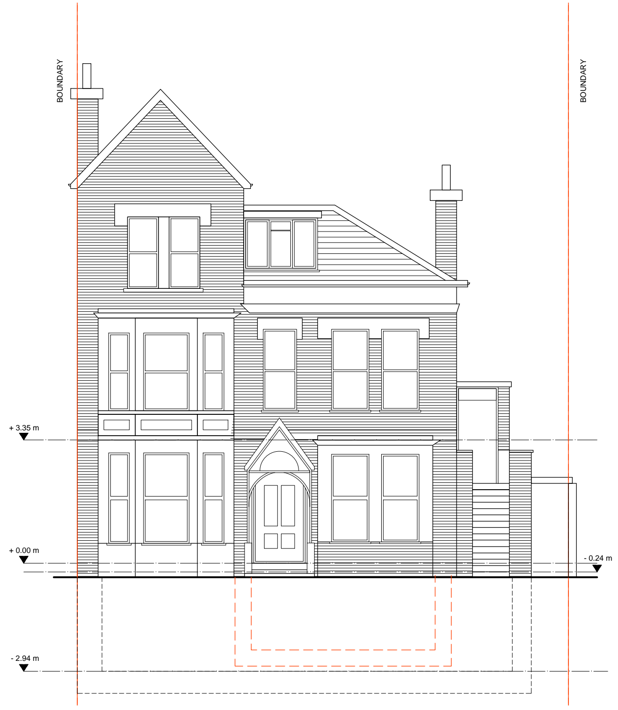
1 FRONT ELEVATION - PROPOSED Scale: 1:100