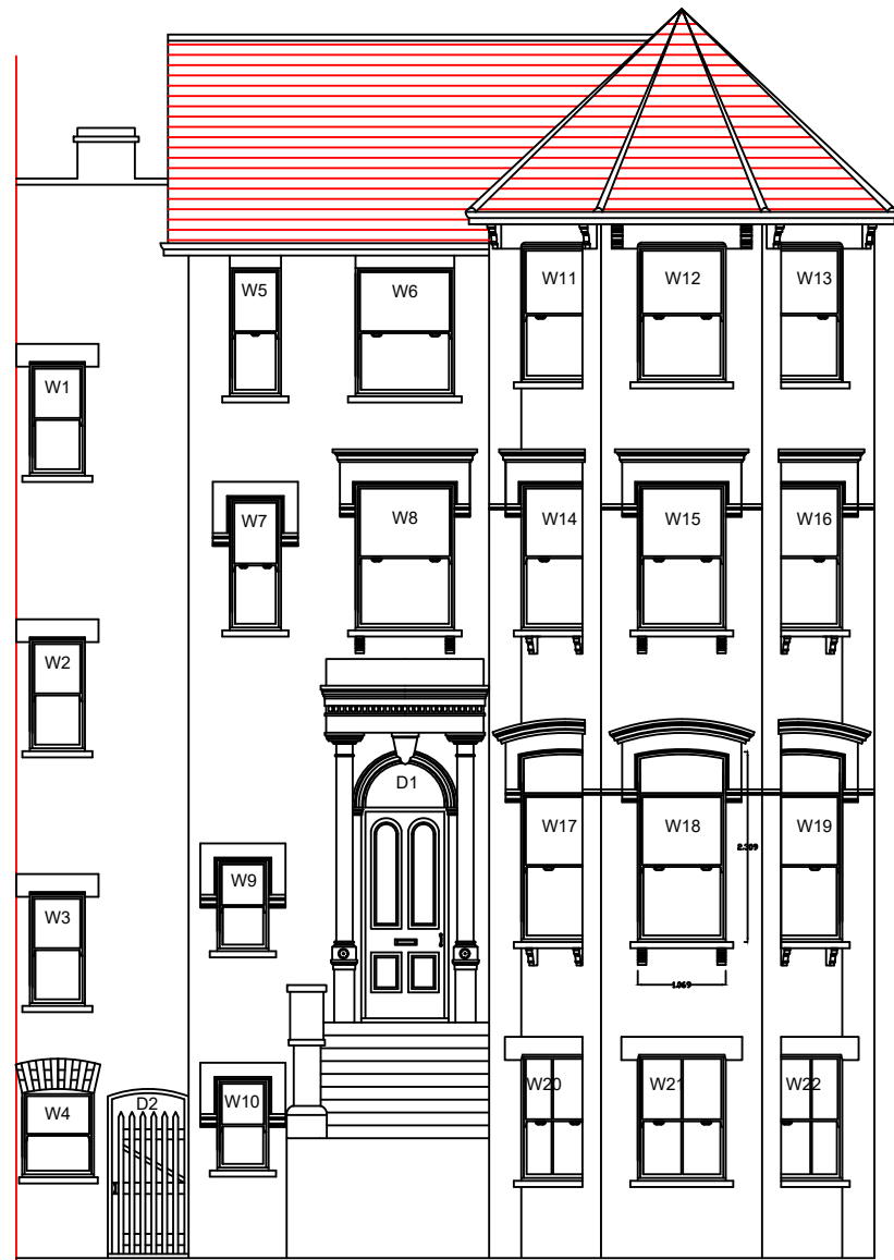
FRONT ELEVATION (Proposed)

Proposed are replacement for single glazed sash window to like for like timber slim-lite Double glazed sash window.