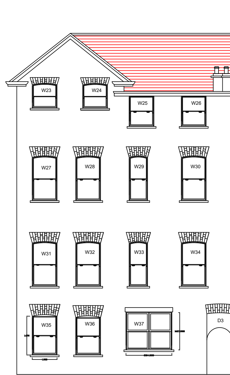
REAR ELEVATION (Proposed)

The fenestration will be followed to the front, side and rear elevation.