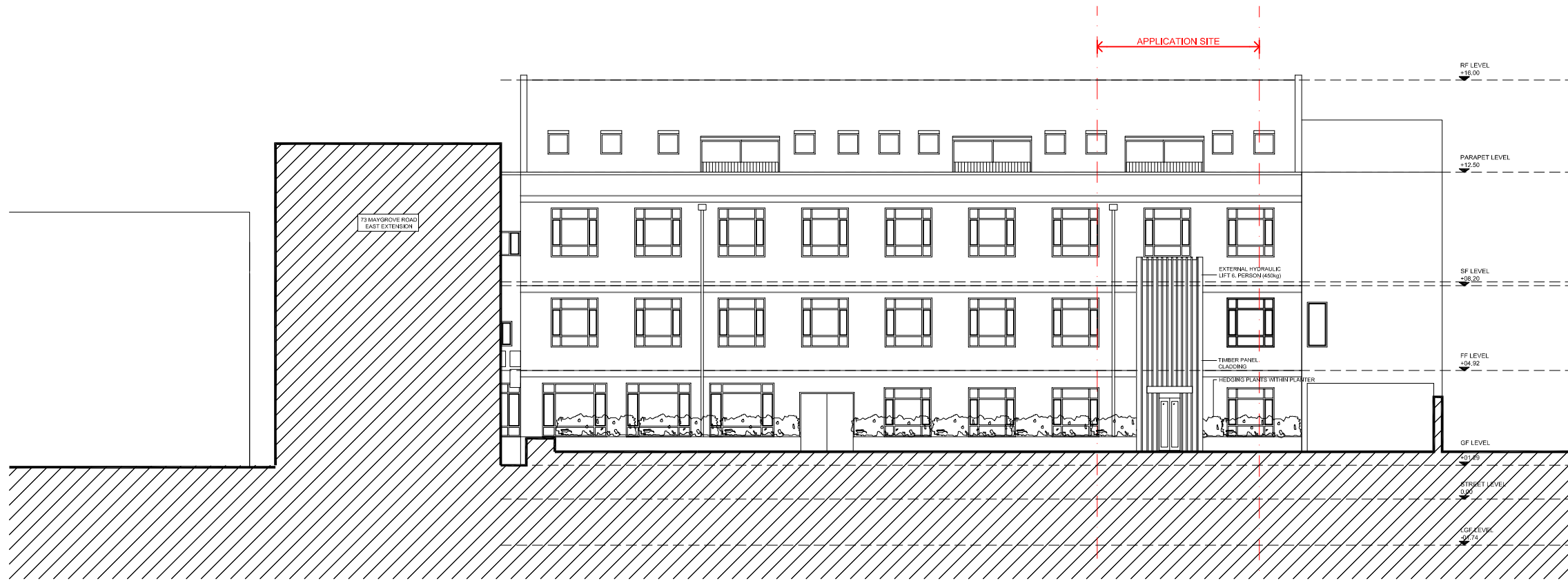
3 PROPOSED NORTH ELEVATION PL3(20)E00 SCALE: 1:200 (A3)