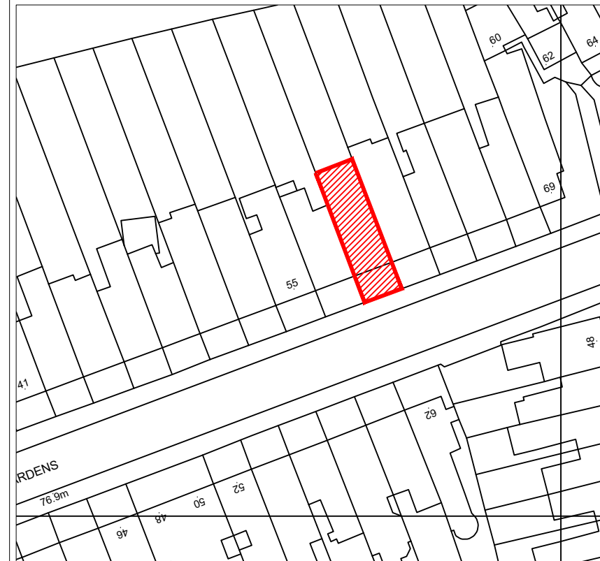
LOCATION PLAN Scale: 1:1250

NOTE: - All dimensions in this drawings are metric.