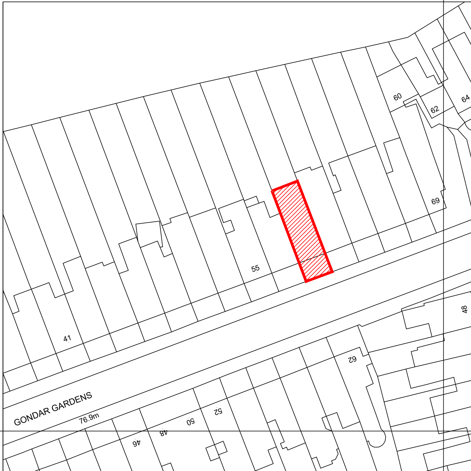
SITE PLAN Scale: 1:500