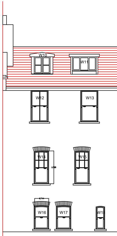
REAR ELEVATION (Proposed)