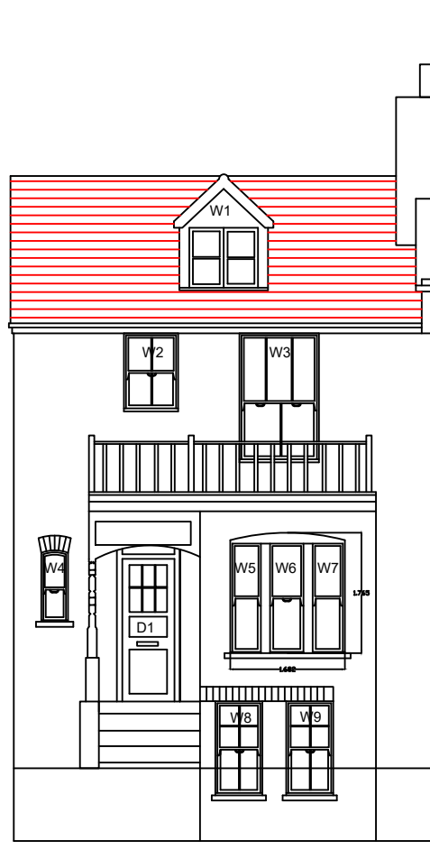
FRONT ELEVATION (Existing)

Existing windows are single glazed timber sash to be replaced.