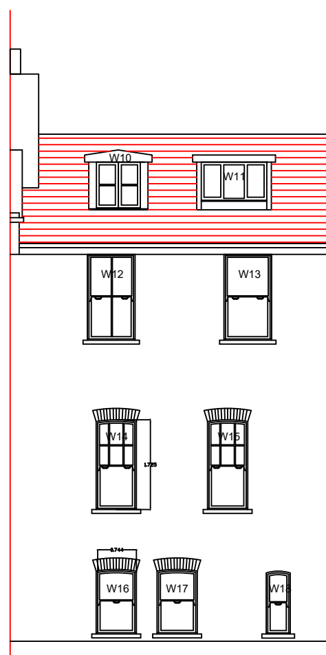
REAR ELEVATION (Existing)

Existing windows are single glazed timber sash to be replaced.