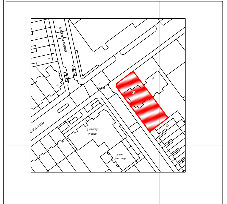
LOCATION PLAN Scale: 1:1250

NOTE: - All dimensions in this drawings are metric.