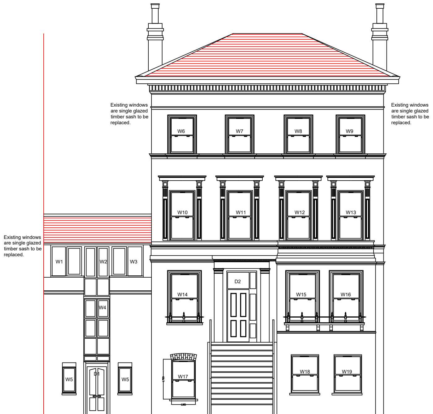
FRONT ELEVATION (Existing)

EXISTING TIMBER SINGLE GLAZED WINDOW TO BE REPLACED