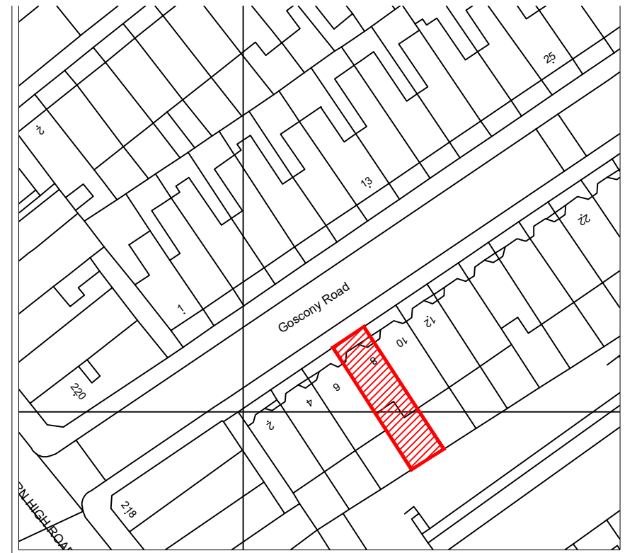
LOCATION PLAN Scale: 1:1250

NOTE: - All dimensions in this drawings are metric.