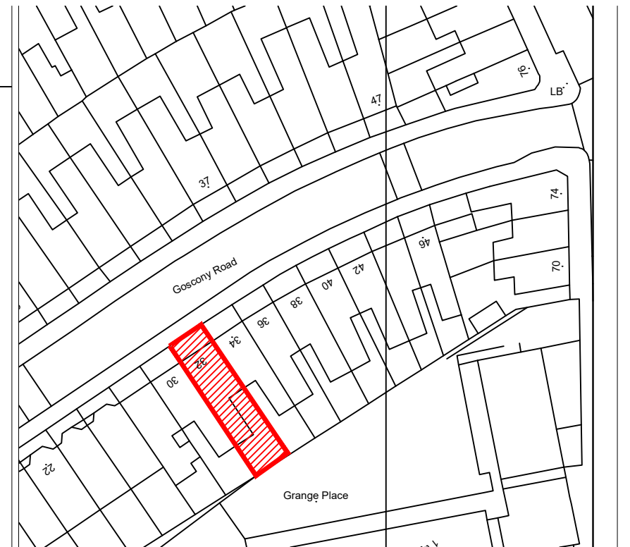
LOCATION PLAN Scale: 1:1250

NOTE: - All dimensions in this drawings are metric.