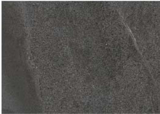
HER04 Natural Finish

Colour Sample from Shackerley Catalogue (Detail)