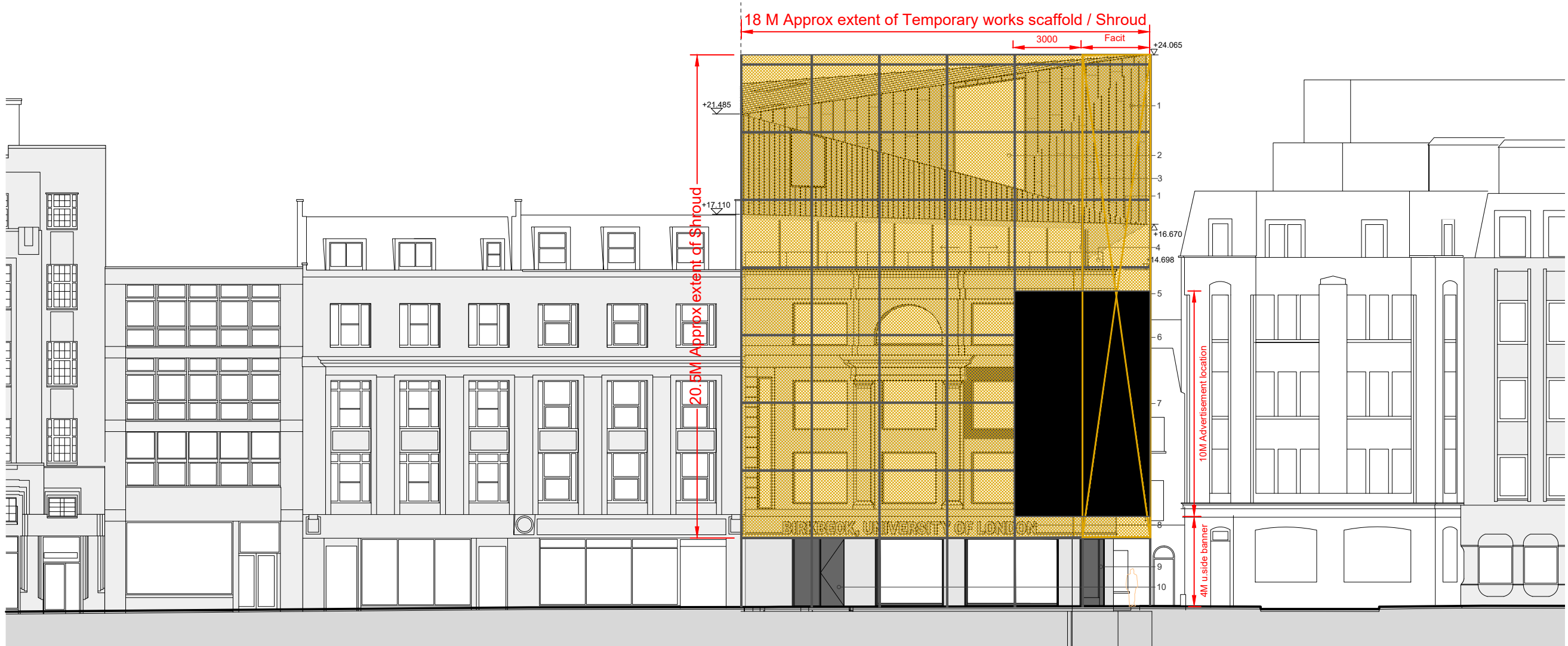
Proposed North Elevation - Euston Road Scale 1 : 200