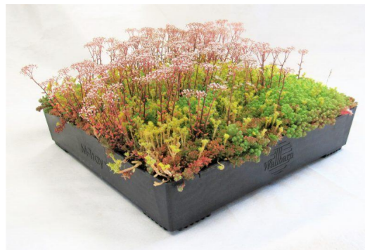
M-Tray by wallbarn

Developed to accommodate sedum roof Trays dimensions: Height: 100mm Width/breath: 500x500mm Material: Recycled Polypropylene Thickness of material:3mm Weight planted&saturated:24Kg