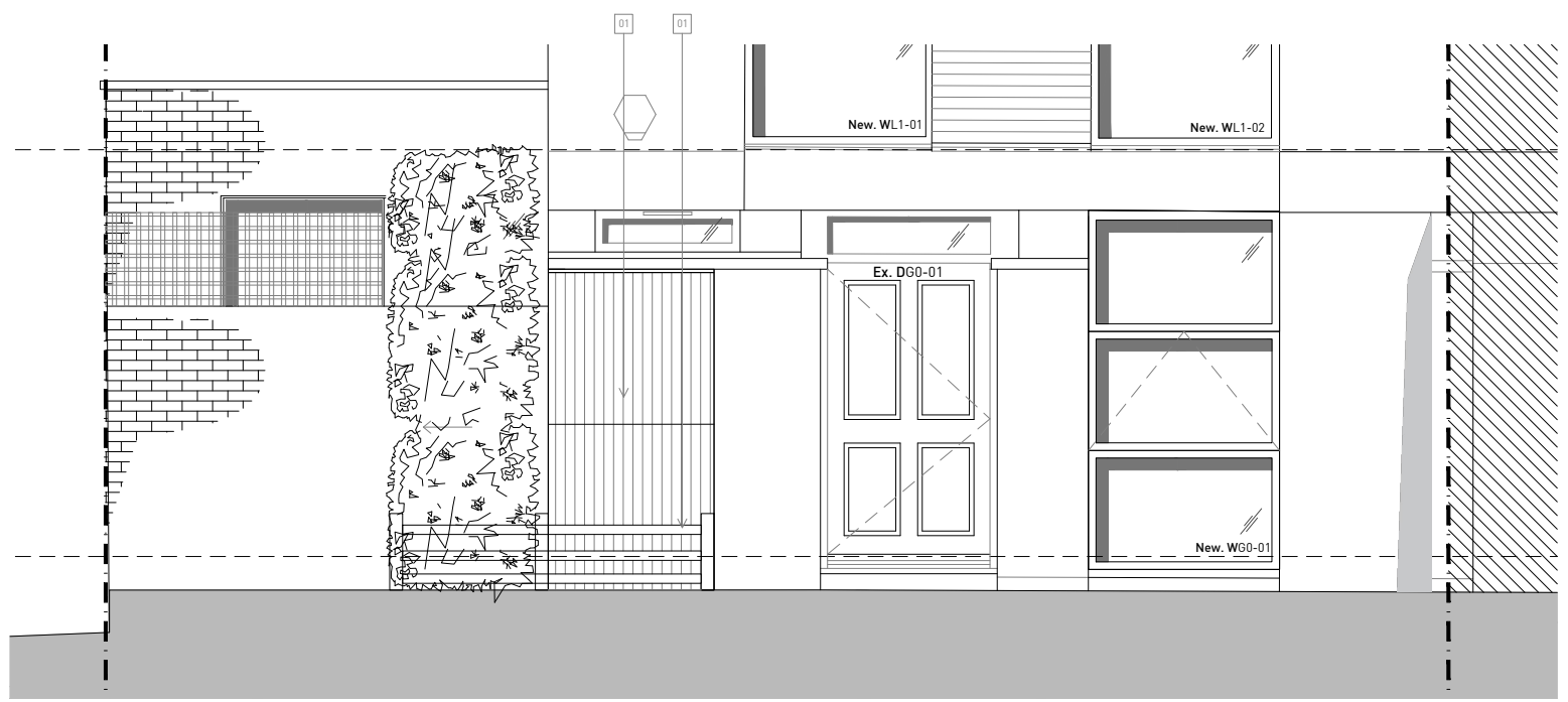
PROPOSED STREET/CYCLE AND BIN STORE ELEVATION 1:25 @ A1 / 1:50 @ A3