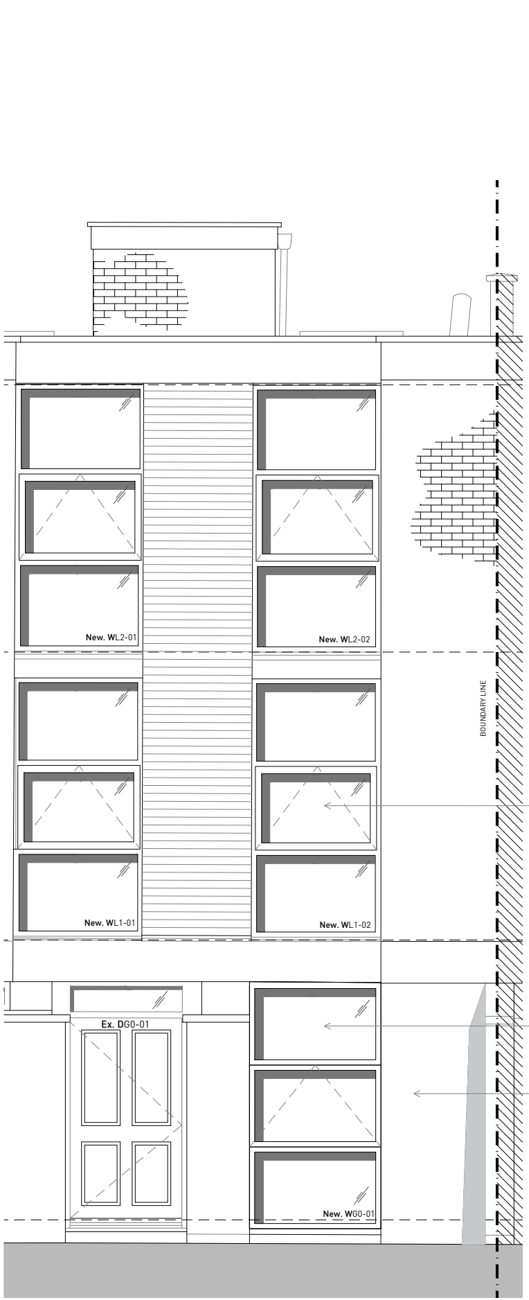
PROPOSED WINDOW ELEVATION 1:25 @ A1 / 1:50 @ A3