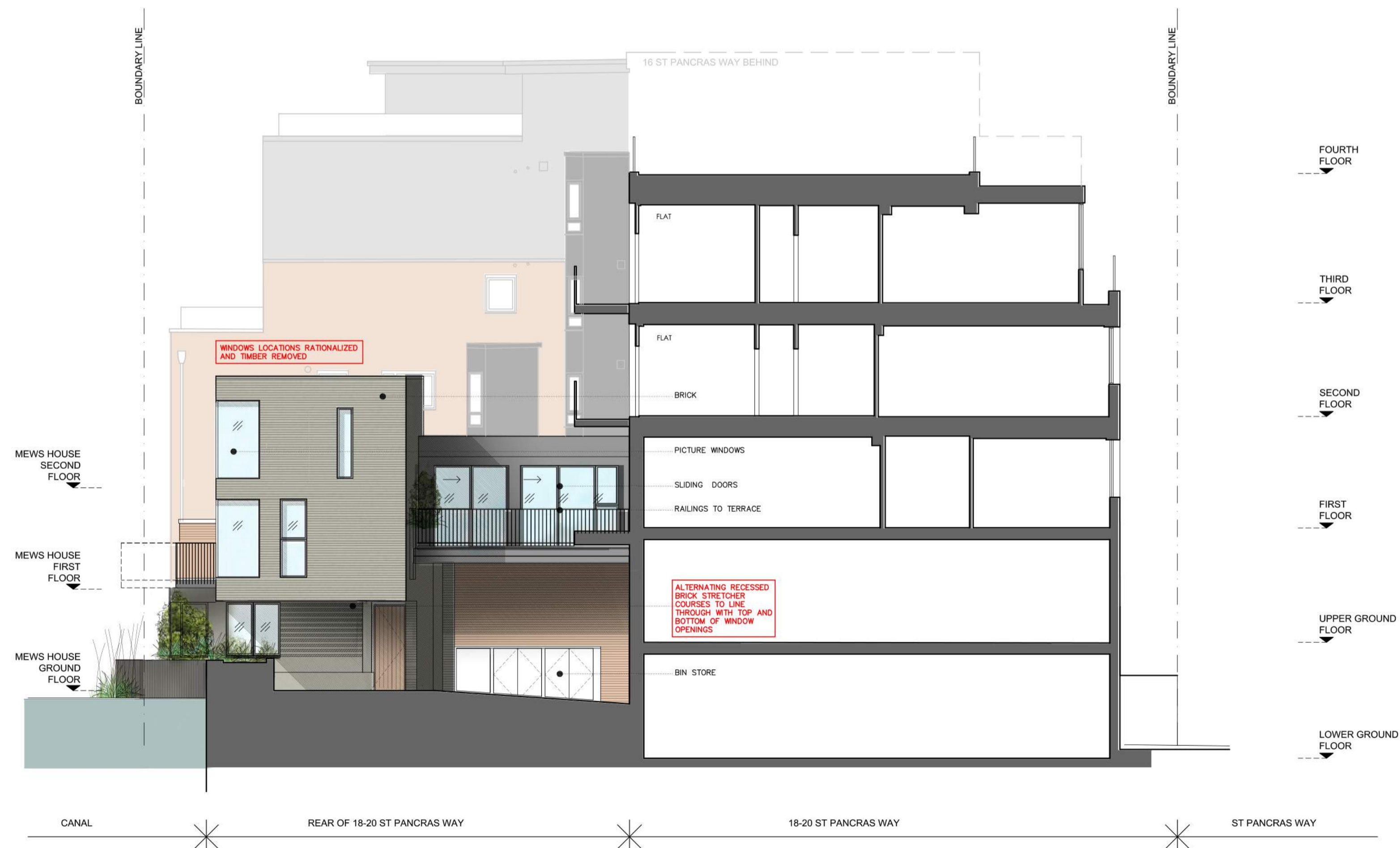
REAR PARKING ELEVATION

CANAL REAR OF 18-20 ST PANCRAS WAY 18-20 ST PANCRAS WAY ST PANCRAS WAY