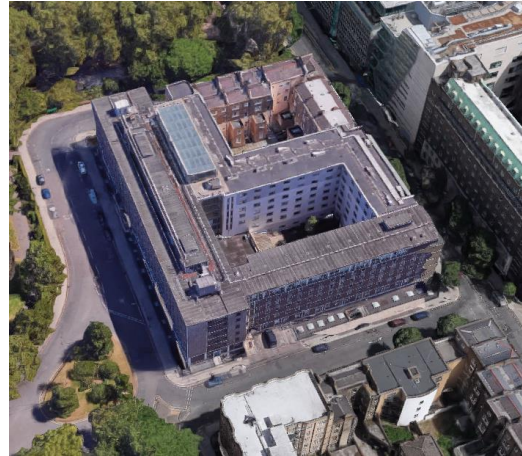
Views of the Site (Google Maps)