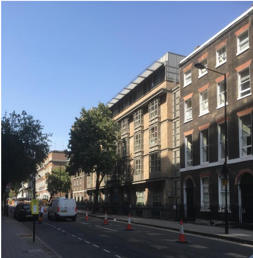
Photo of International Hall from the street