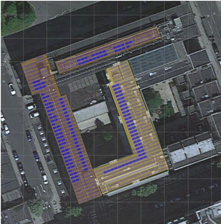
Proposed layout of panels