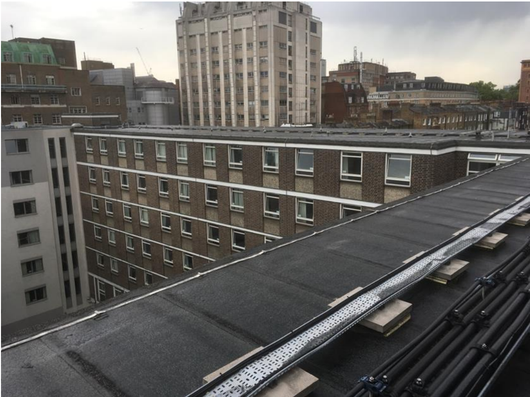
Photo of existing roof