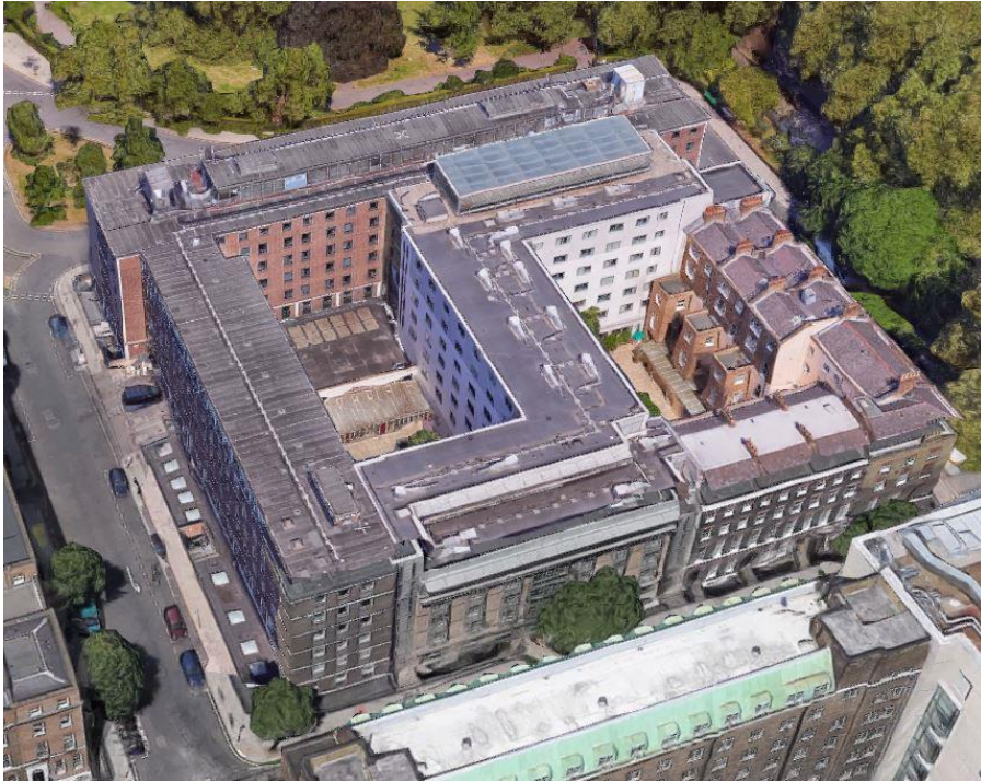
Aerial view of International Hall