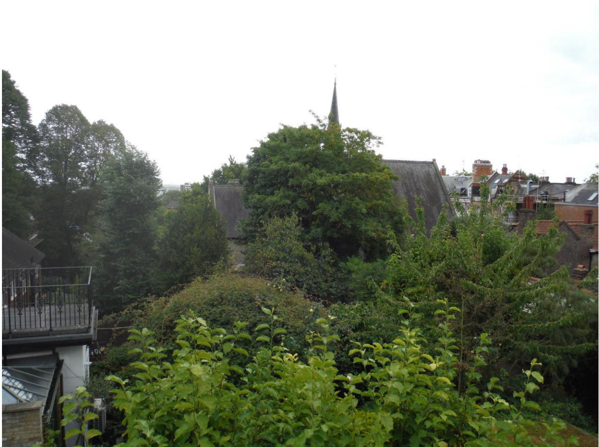
Views from rear of the terrace, showing the existing screening and general lack of visibility