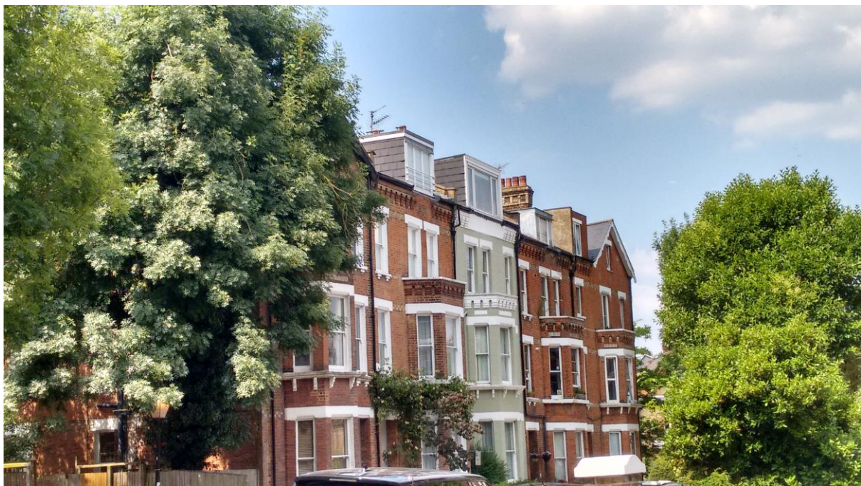
Views along Kemplay Road