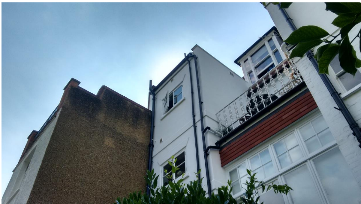
Rear of terrace, showing extension and terrace to No. 6 (the large, deeply projecting addition) and the raising closet wing and infill with terrace to No. 8 adjoining (with the terracotta hanging tiled fenestration)