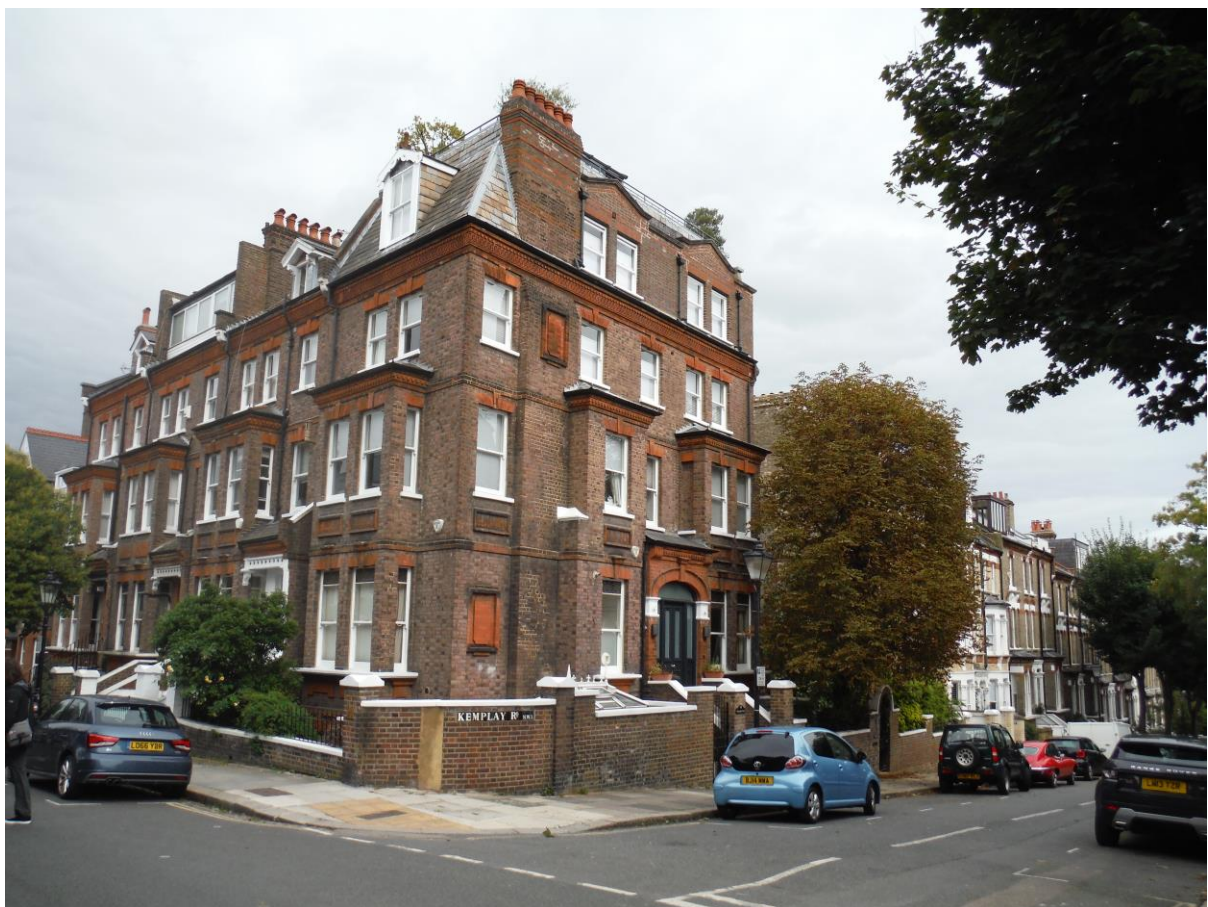
Views of Willoughby Road, and with corner of Kemplay Road, to the north of the appeal site