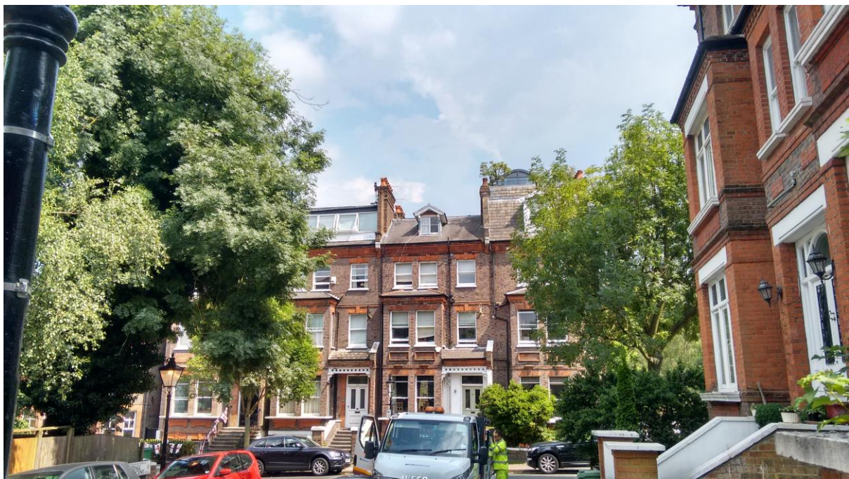
Further views along Willoughby Road, showing diverse character and alterations to properties