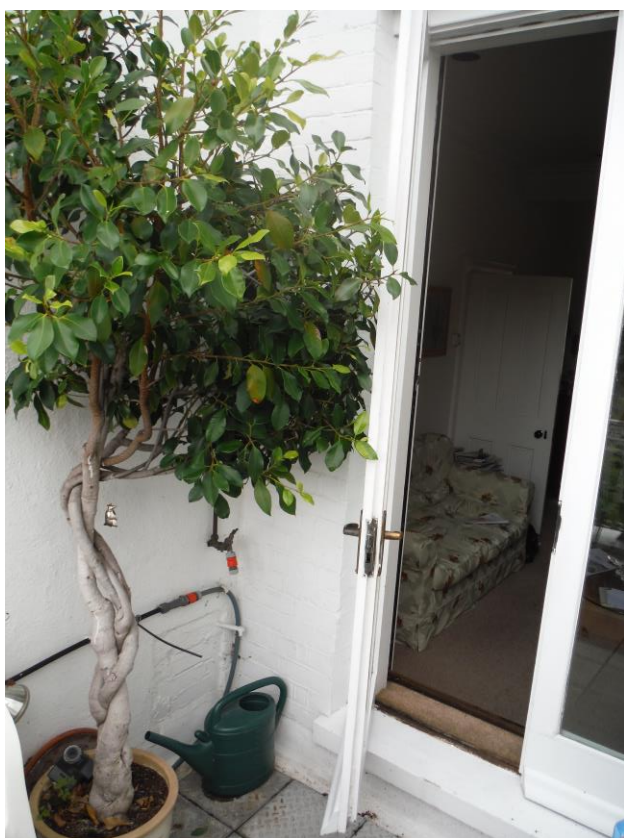
Views of existing terrace