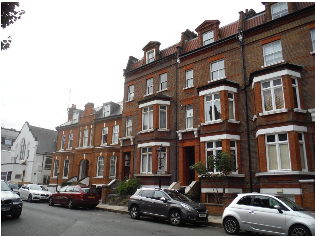
Views along Willoughby Road, with terrace contained appeal property in top photo