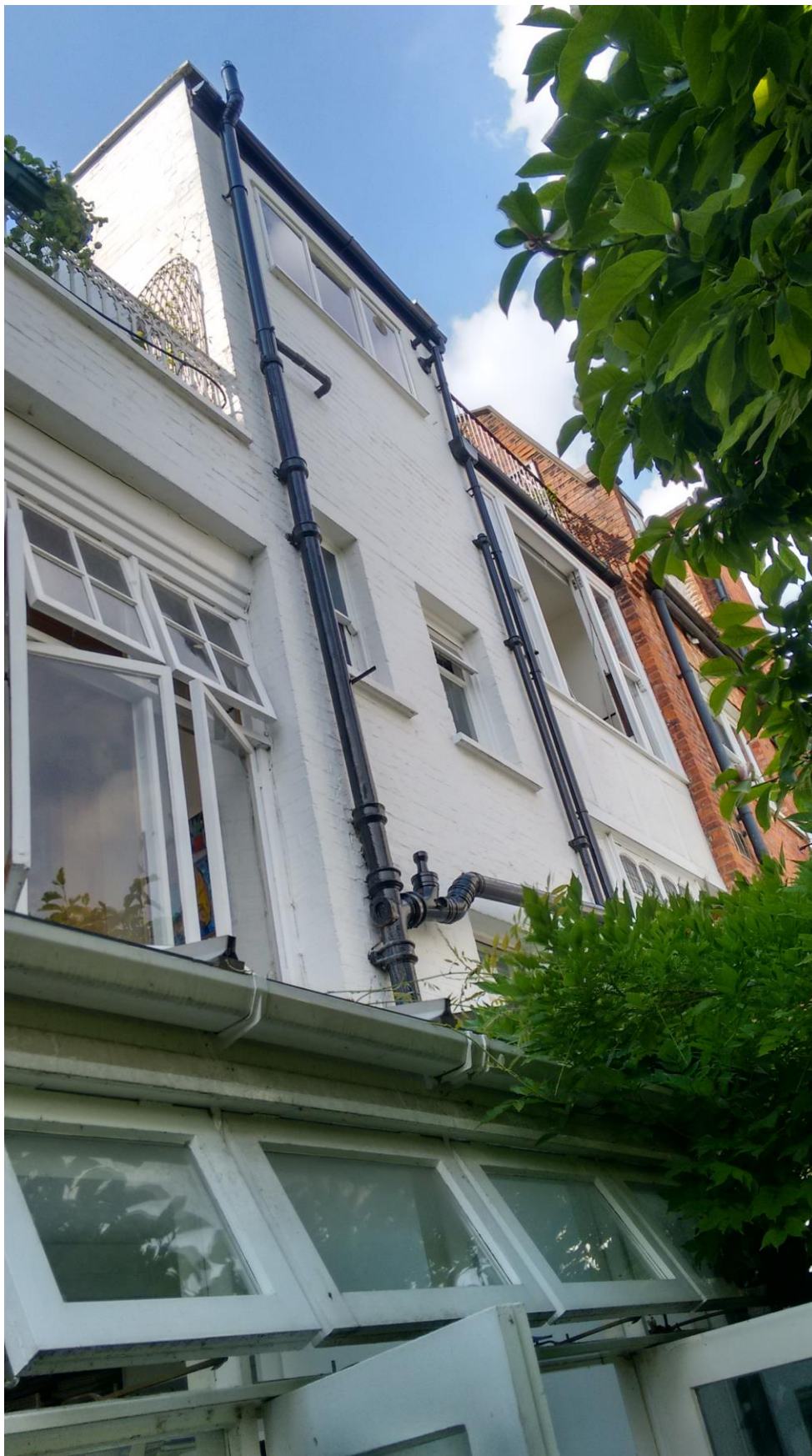
The existing rear infill and terrace to No. 12, and ground floor extension, with the existing two storey infill extension to No. 14 adjoining visible