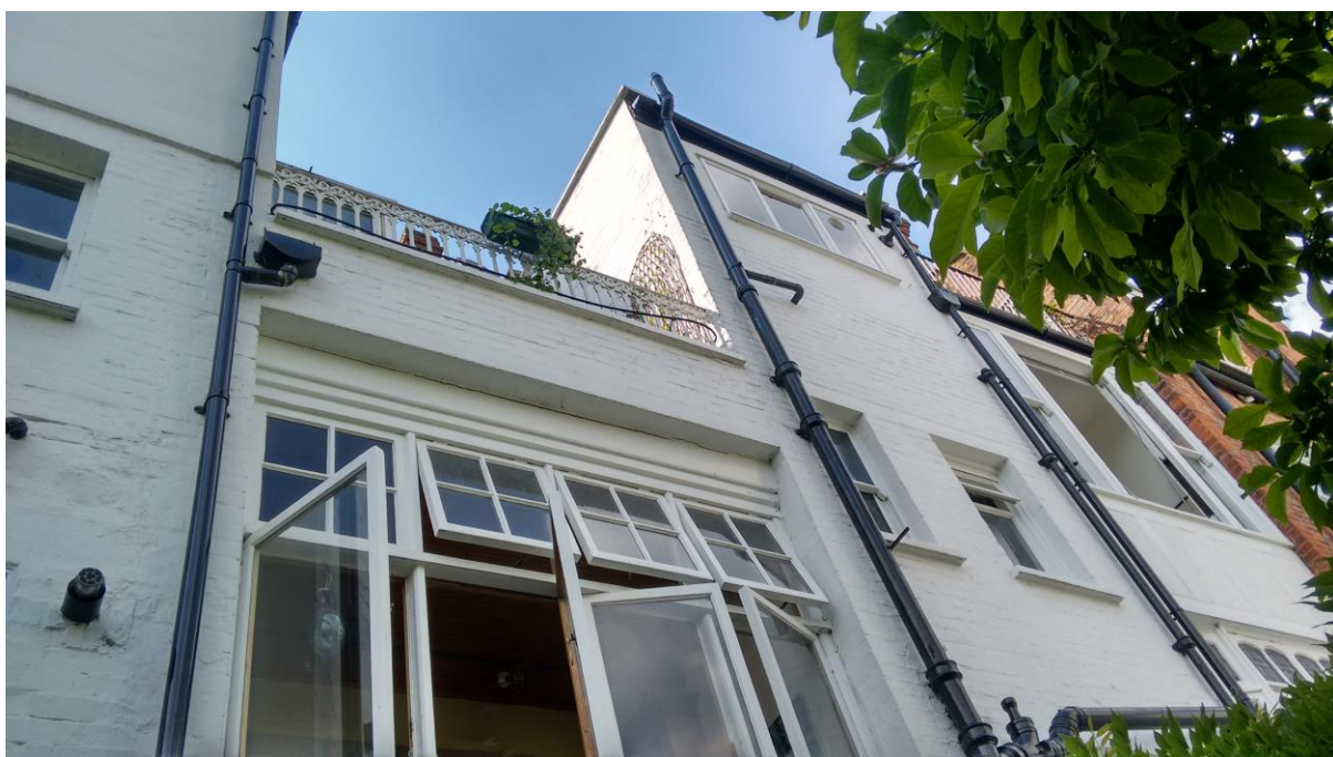
The rear of the appeal property: top photograph shows existing terrace and infill extension; bottom photograph shows extension to No. 14 adjoining