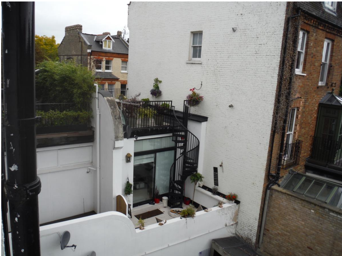
Views from the existing rear terrace at the appeal property, including views towards terraces at the rear of the Kemplay Road properties