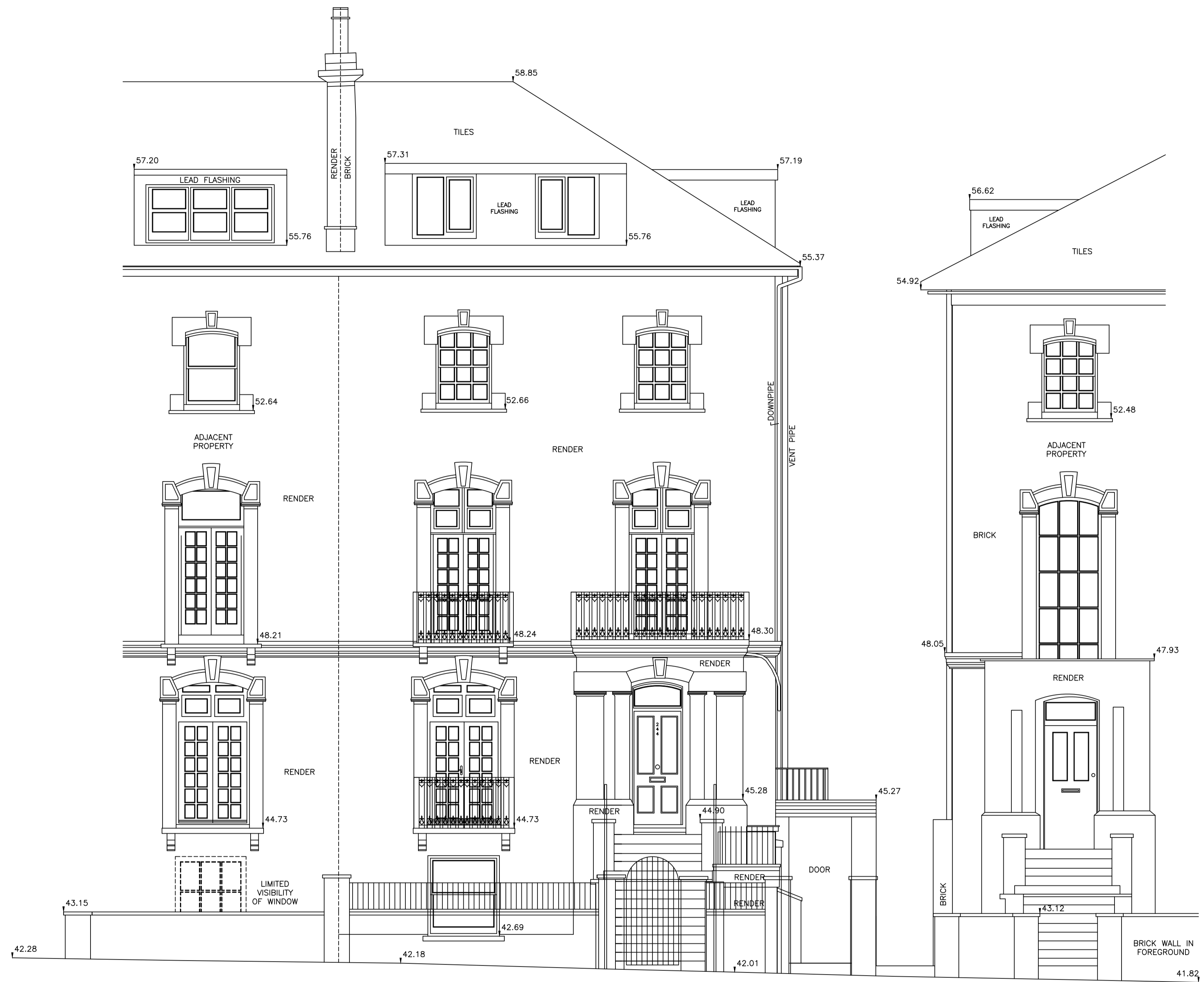
FRONT ELEVATION (NORTH WEST)

NOTES: - LEVELS RELATIVE TO ORDNANCE DATUM NEWLYN (MEAN SEA LEVEL)