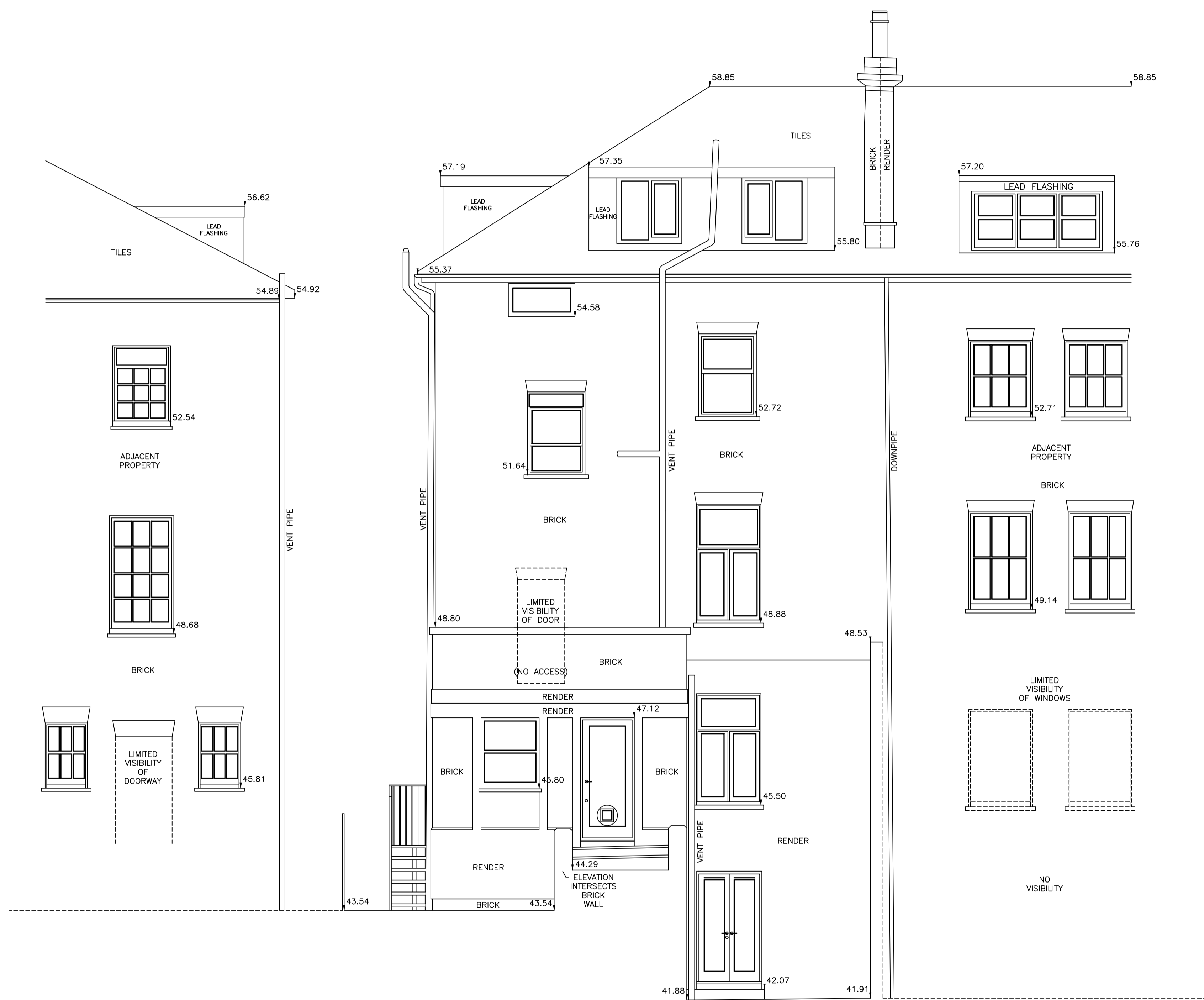
REAR ELEVATION (SOUTH EAST)

NOTES: - LEVELS RELATIVE TO ORDINANCE DATUM NEWLYN (MEAN SEA LEVEL)