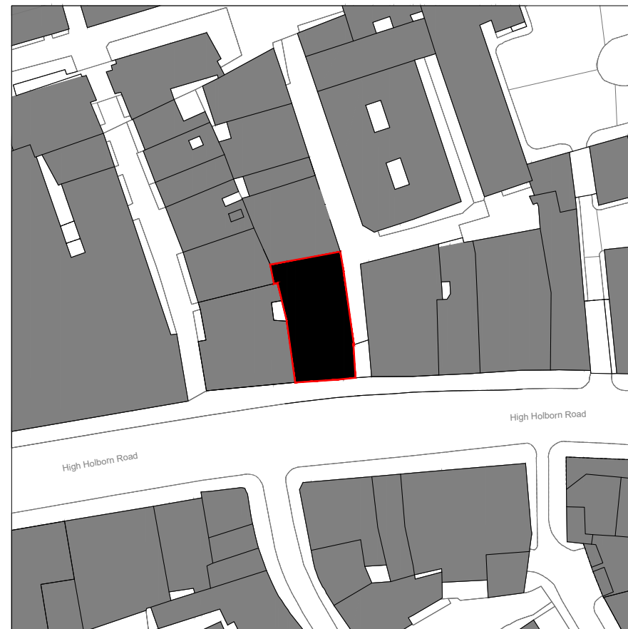
Location Plan Scale: 1/1250