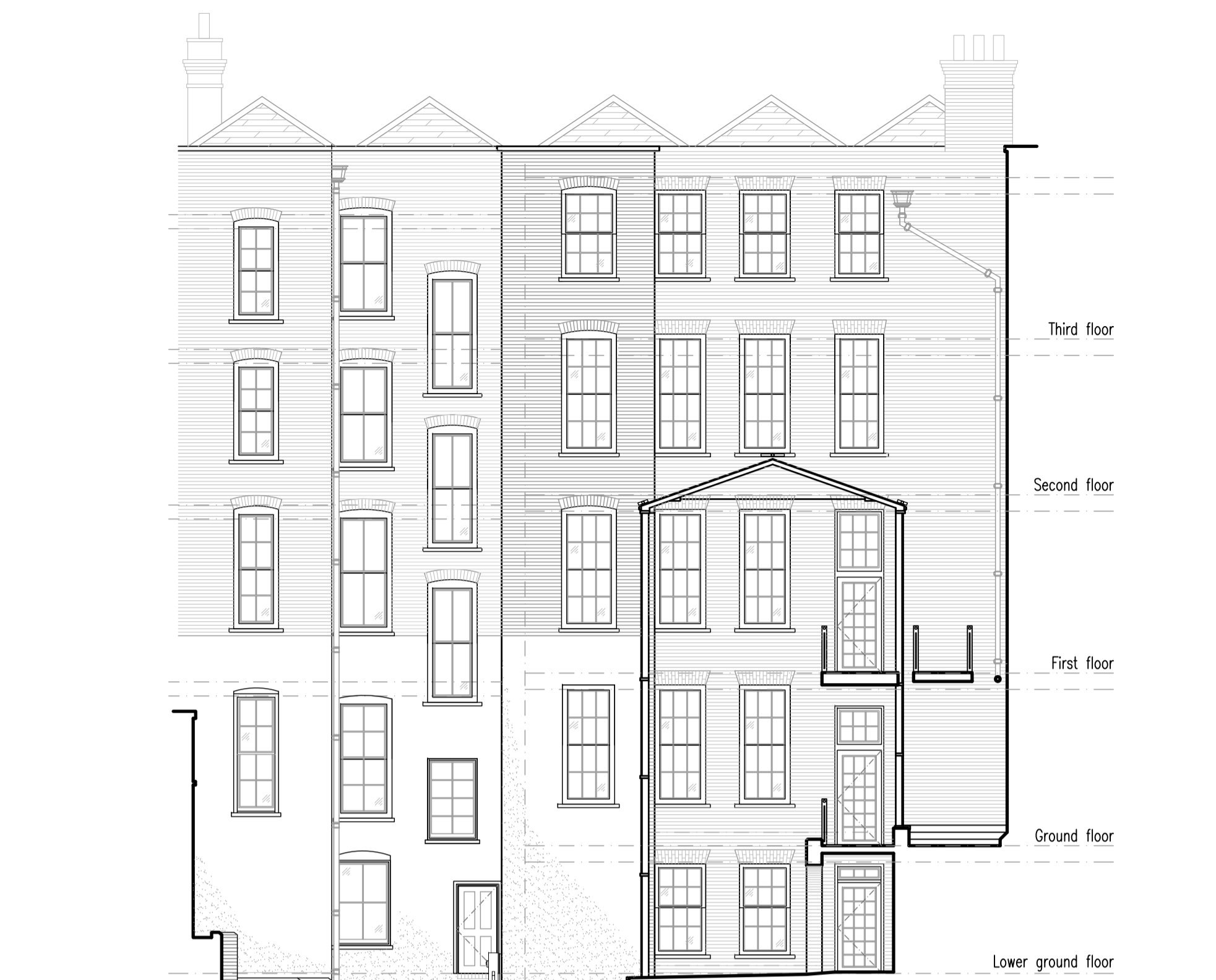
3 Internal courtyard - Elevation Scale 1:100