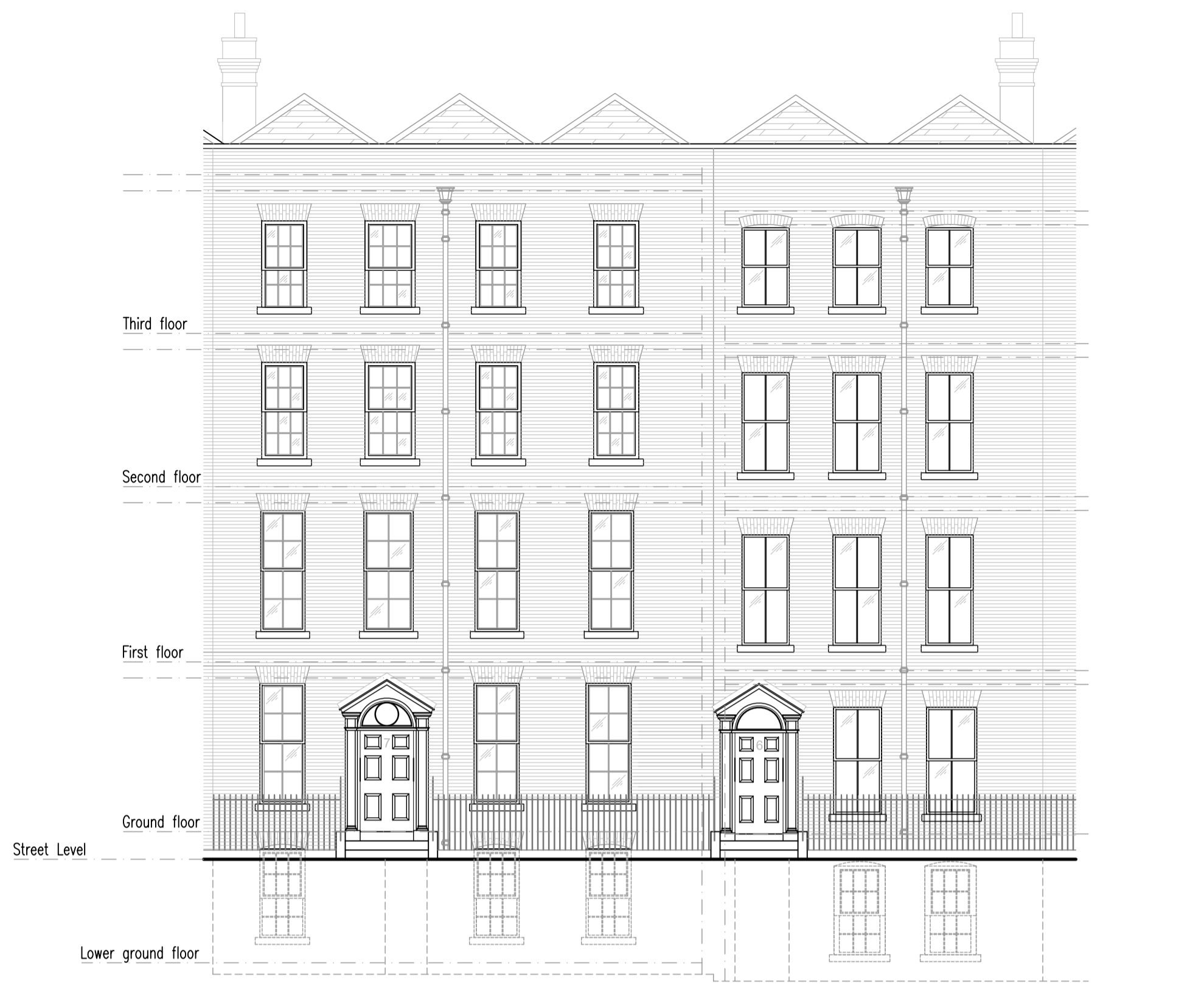
1 Bedford Row - Elevation Scale 1:100