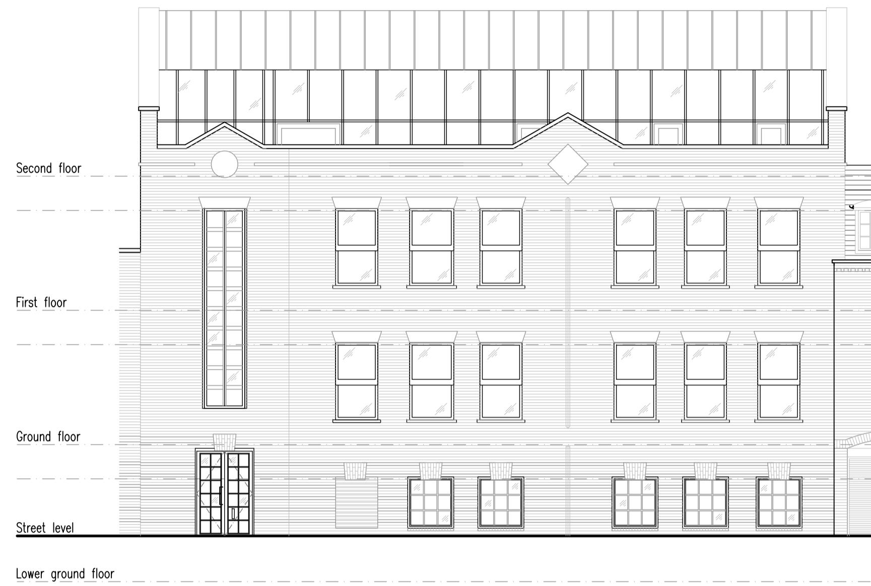
2 Jockey Fields - Elevation Scale 1:100