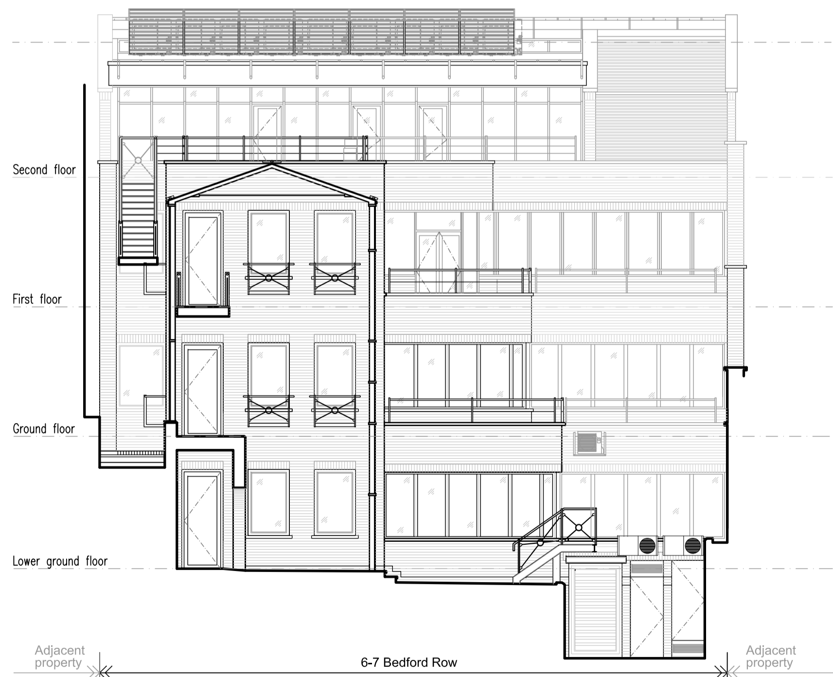
4 Coutyard - Elevation Scale 1:100