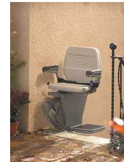
LIFT IN SWIVEL POSITION AT TOP OF STEPS