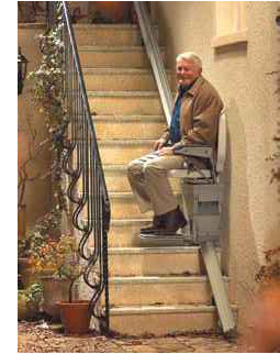
LIFT IN OPERATION