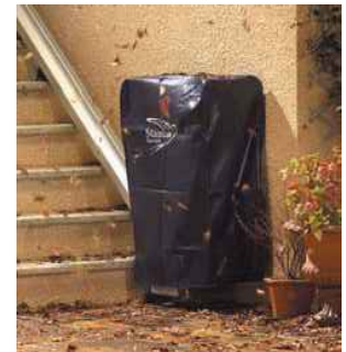
LIFT UNDER PROTECTED COVER