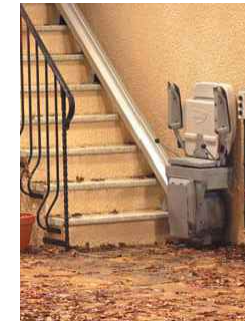
LIFT FOLDED AT BASE OF STEPS