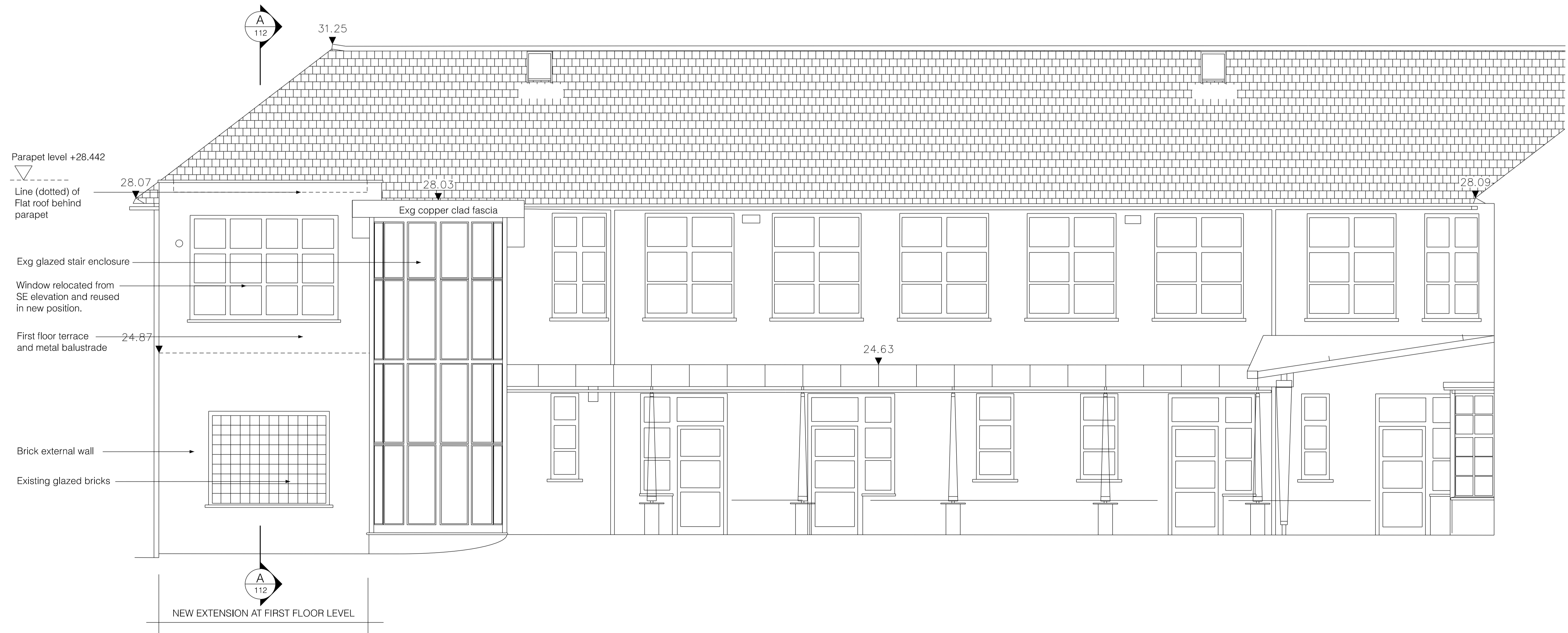
2 Proposed North East Elevation 1:50 @ A1