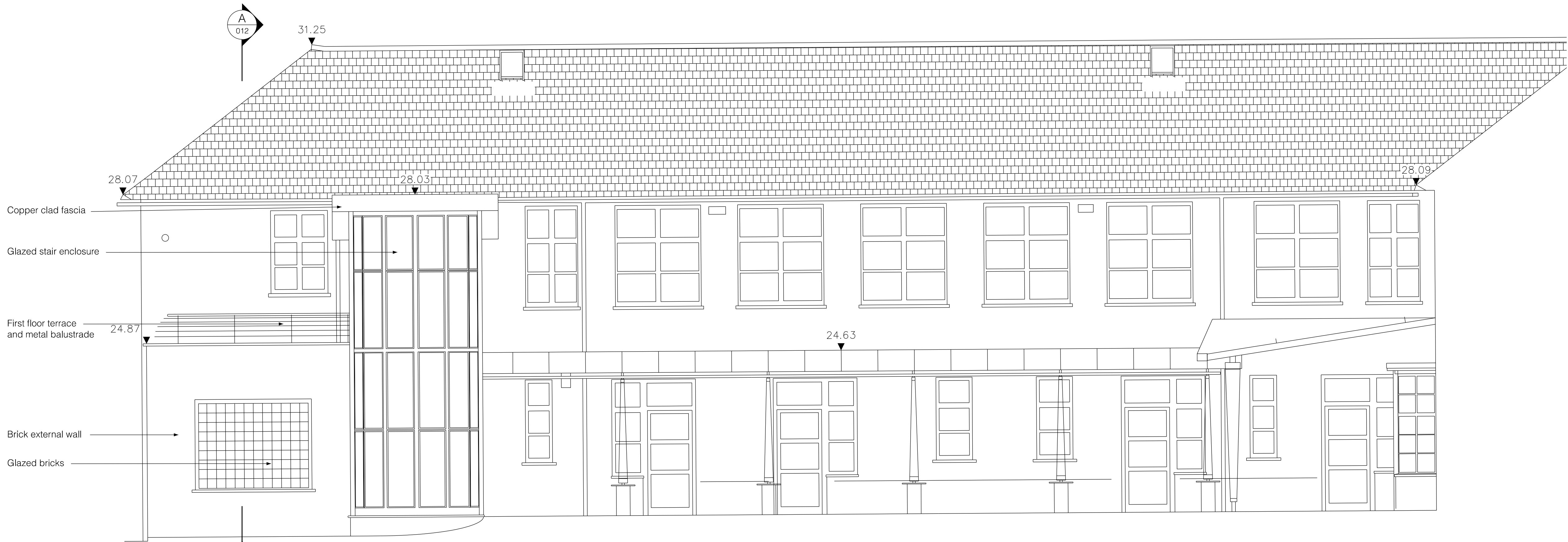
2 Existing North West Elevation 1:50 @ A1