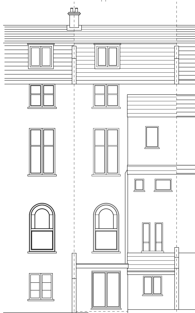
1:100 Proposed Rear Elevation