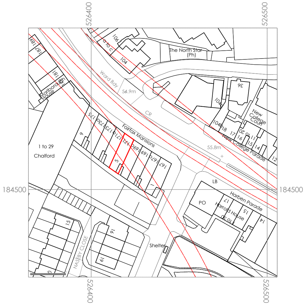
LOCATION PLAN 1:1250 @ A4