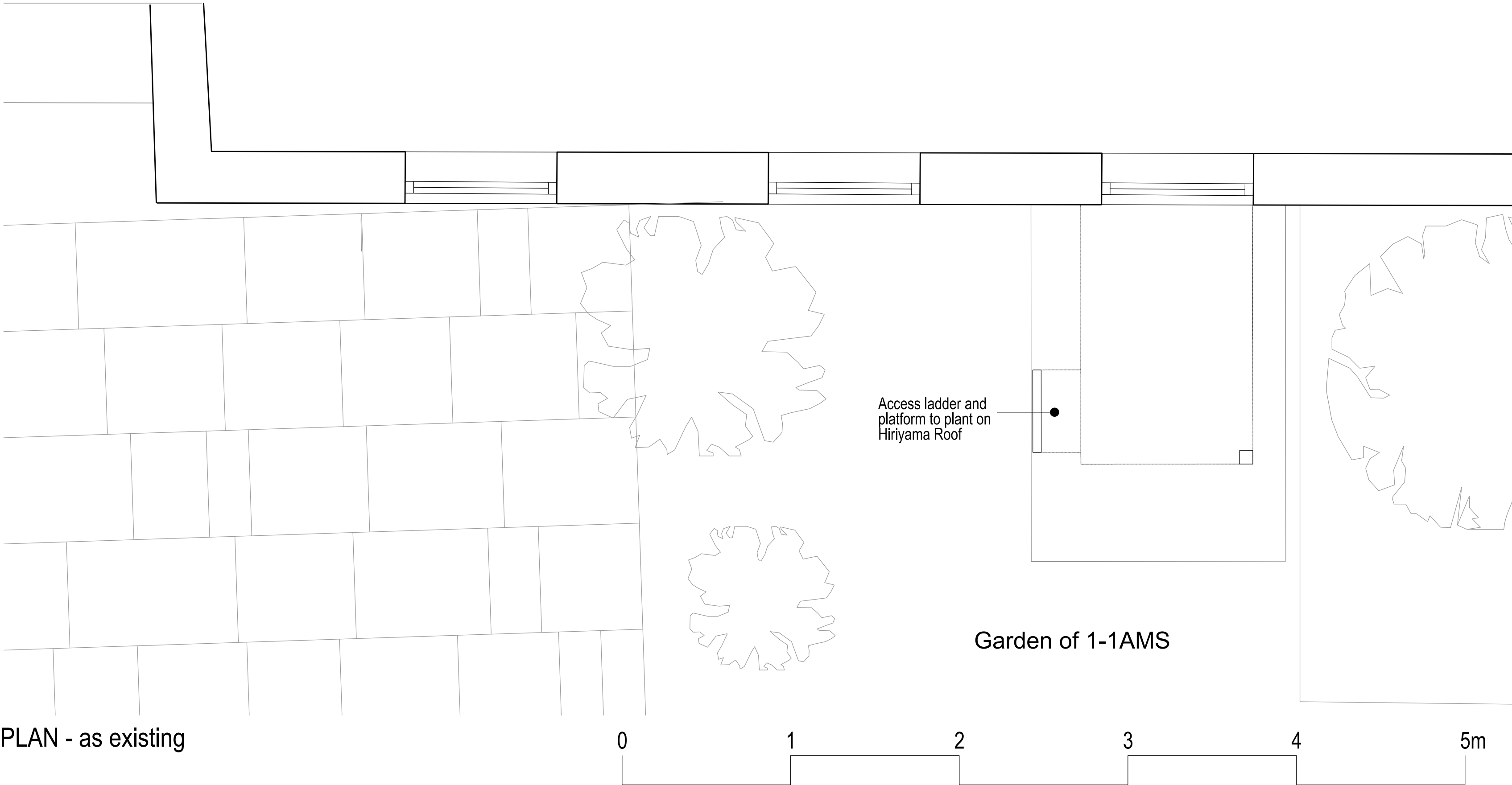
PLAN - as existing