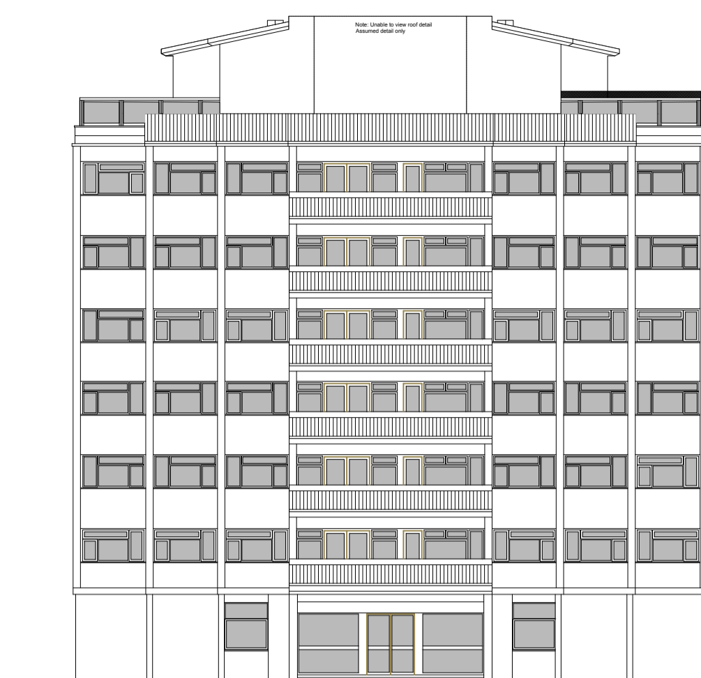
Existing Site Elevation (South Face)