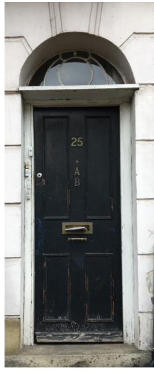
Front Elevation Existing Door Proposed door