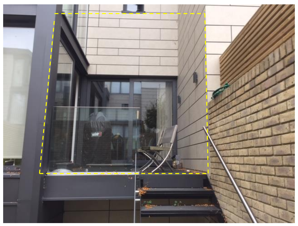
Photo.3 View back towards No.19 indicating area of infil extension.