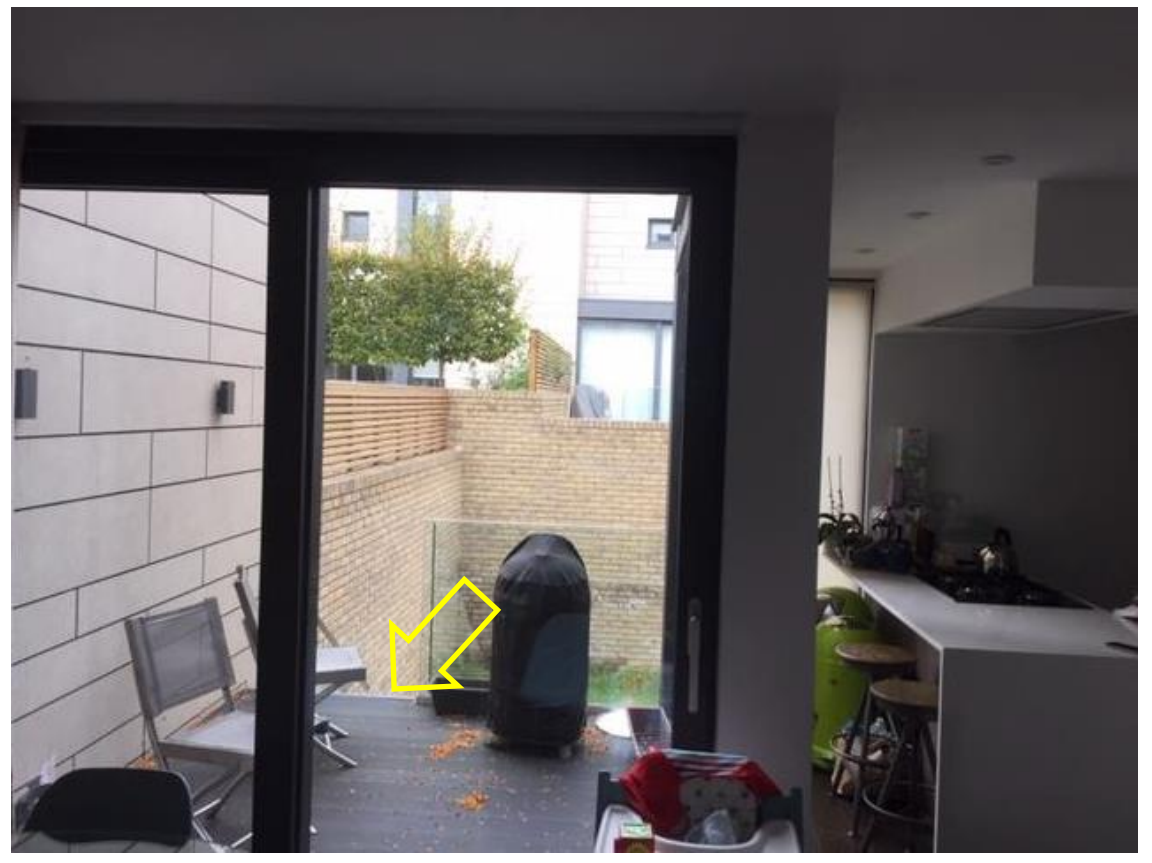
Photo.1 View from within No.11 looking out towards parallel block. Arrow indicates extent of proposed extension.

The property currently consists of a three bedroom unit arranged over four floors and is a mid-terrace within a run of four.