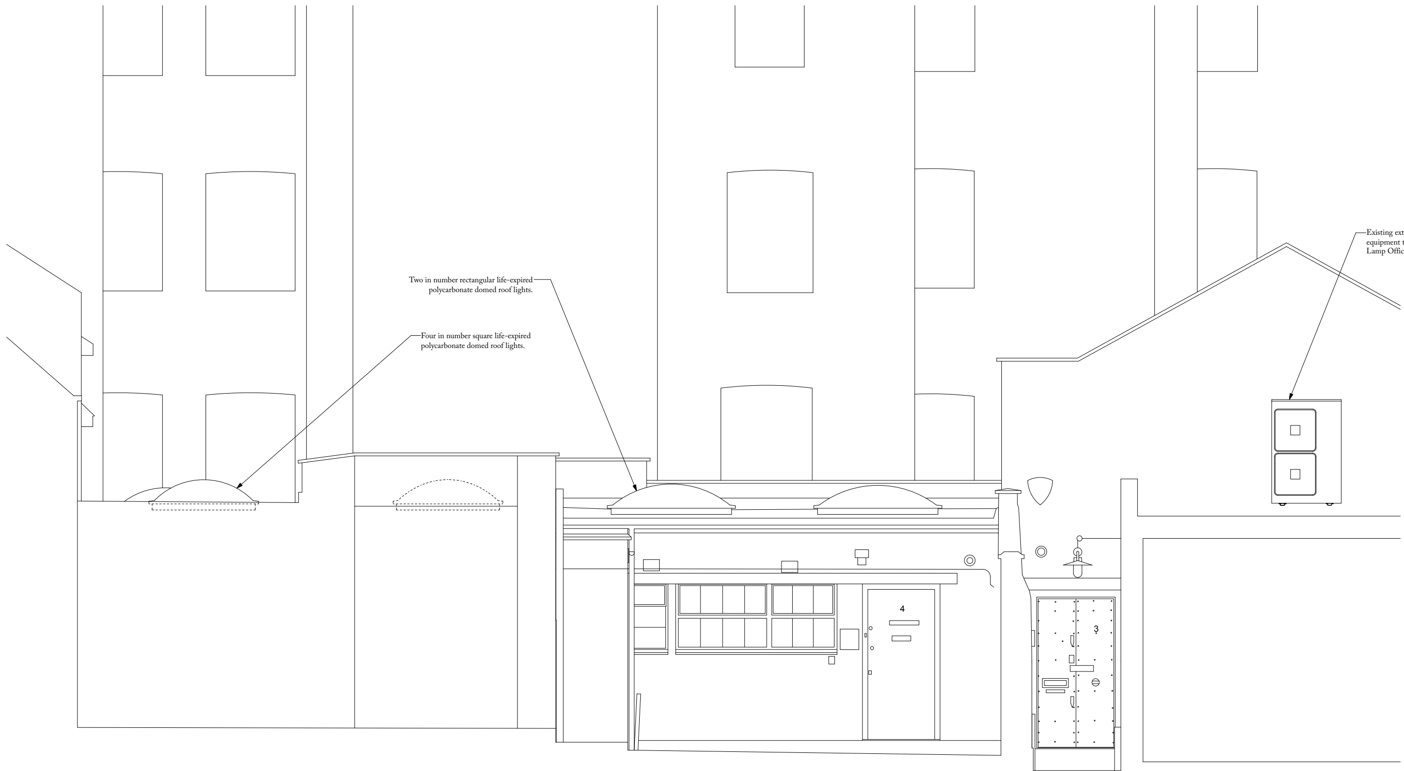
① EXISTING ELEVATION AA 1:50@A3