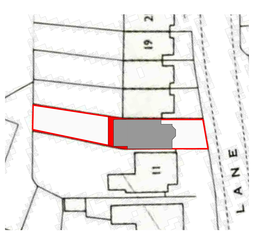
PROPOSED SITE PLAN SCALE 1:500