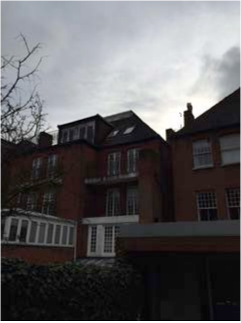
③ No. 16 Wedderburn Road as viewed from the rear garden of 18 Wedderburn Road.