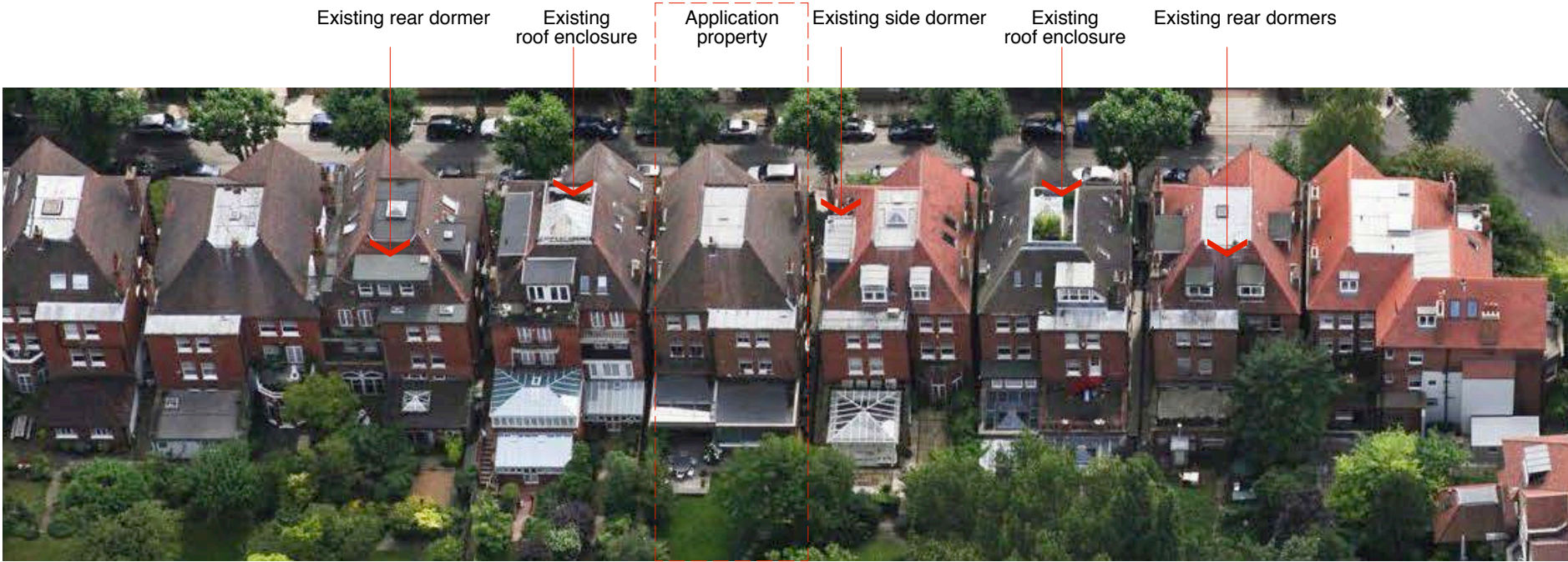
⑥ Existing birds eye rear view of Wedderburn Road properties 10-24 (evens). Demonstrates existing alterations to neighbouring properties of the same style