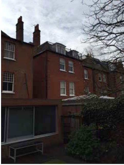
④ No. 20 Wedderburn Road as viewed from the rear garden of 18 Wedderburn Road