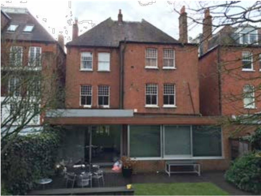
② No. 18 Wedderburn Road rear elevation as viewed from the garden