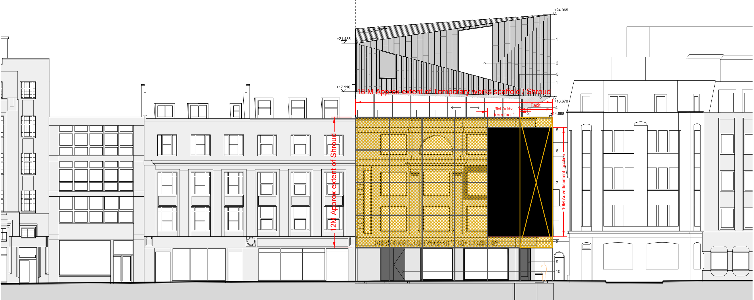
Proposed North Elevation - Euston Road Scale 1 : 200