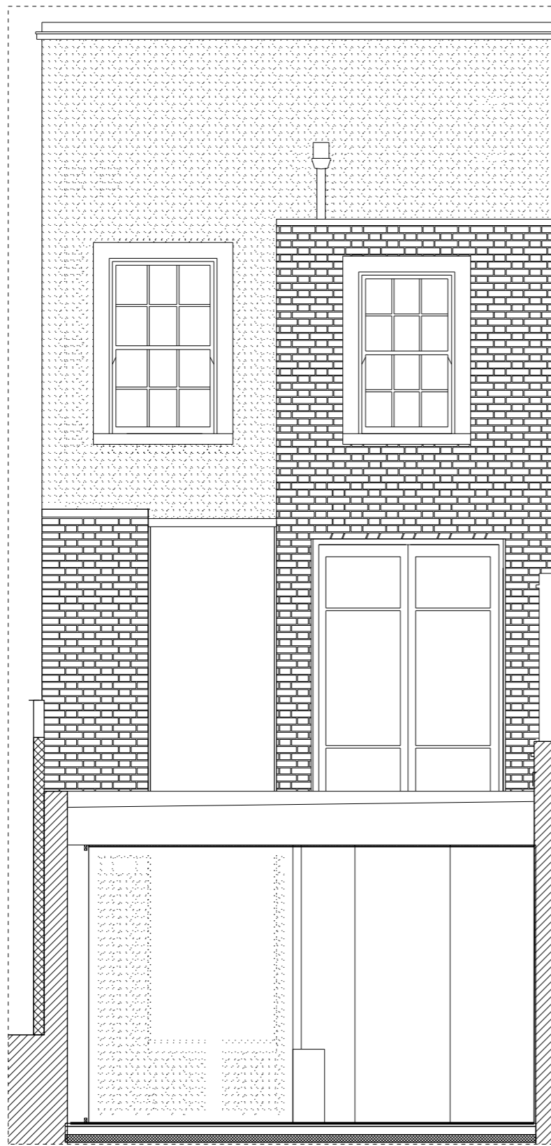
01 EXISTING REAR ELEVATION 08-802 1:50 @ A3