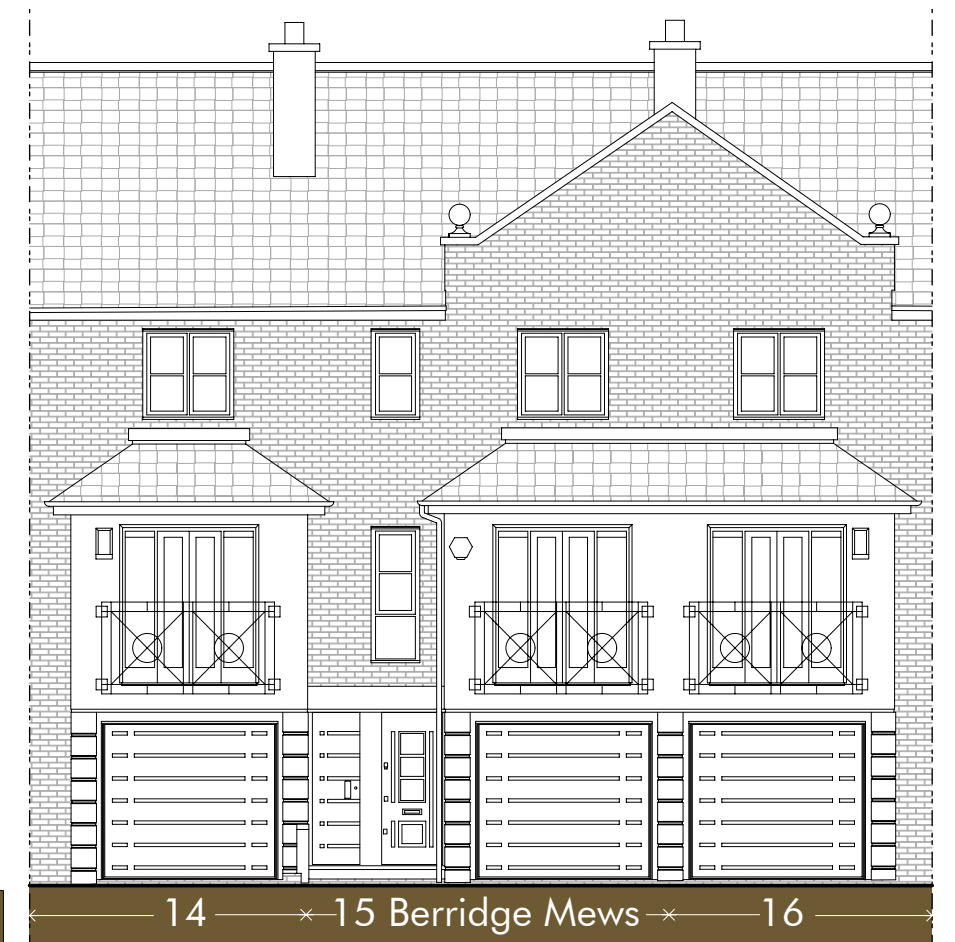
1 Proposed rear elevation 104 scale 1:100@A3 0 1 2 5 m