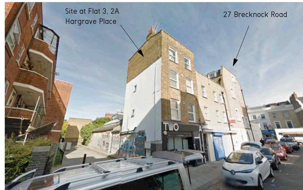
Landleys Fields Flats

Site at: Flat 3 (Top Floor) 2A Hargrave Place London N7 0BP