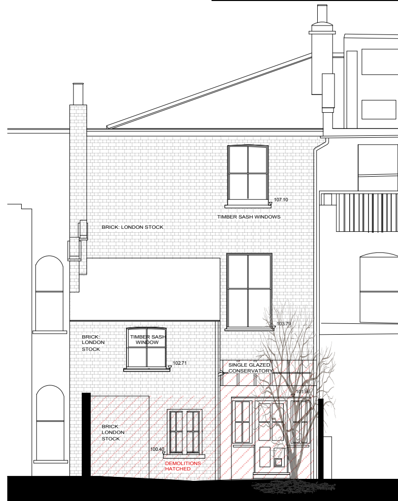
3 Existing Rear Elevation 1:100 @ A3