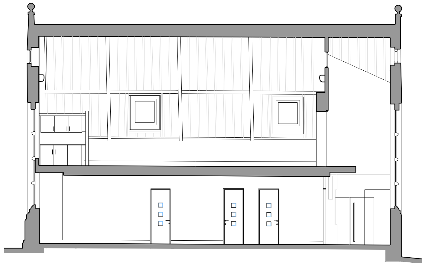
EXISTING SECTION EE