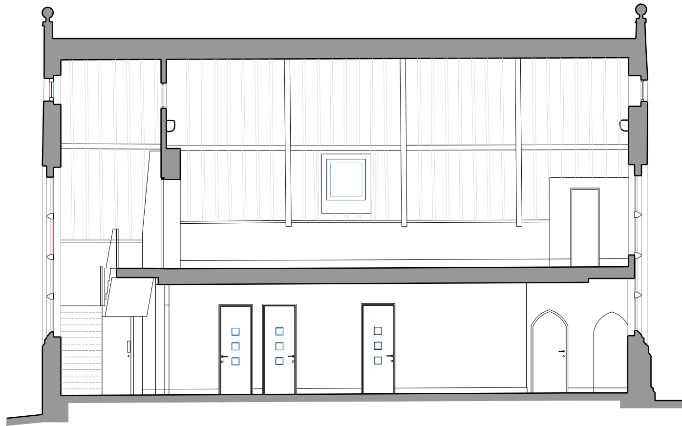
EXISTING SECTION DD