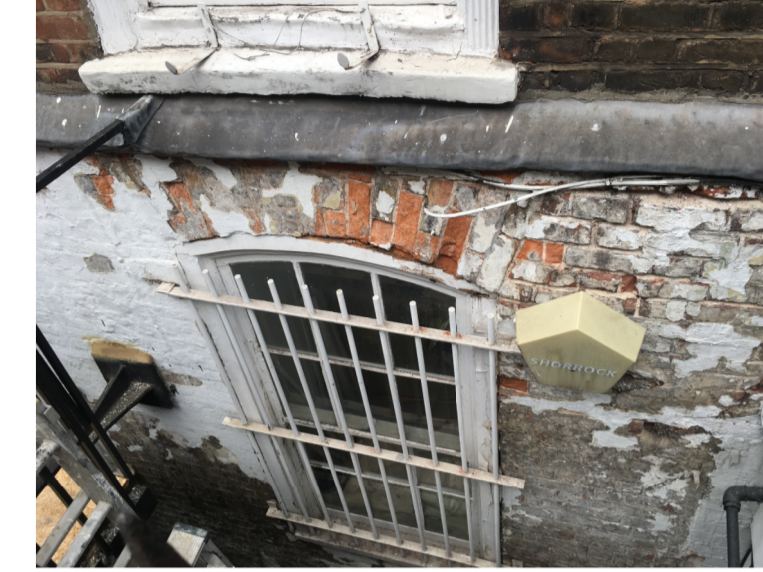
PHOTOGRAPH OF EXISTING LIGHTWELL FACADE

PAINTED CAST IRON VENT 4" (140mm) GRILLS TO BE LOCATED AT EITHER SIDE OF THE LOWER GROUND FLOOR FRONT FACADE TO PROVIDE BACKGROUND VENTILATION TO THE LOWER GROUND FLOOR. VENTS TO BE LOCATED APPROXIMATELY 200MM BELOW INTERNAL CEILING FINISH TO ALIGN WITH EXISTING BRICKS.