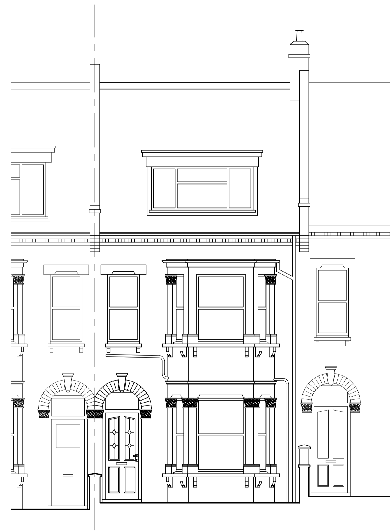
Front (East) Elevation