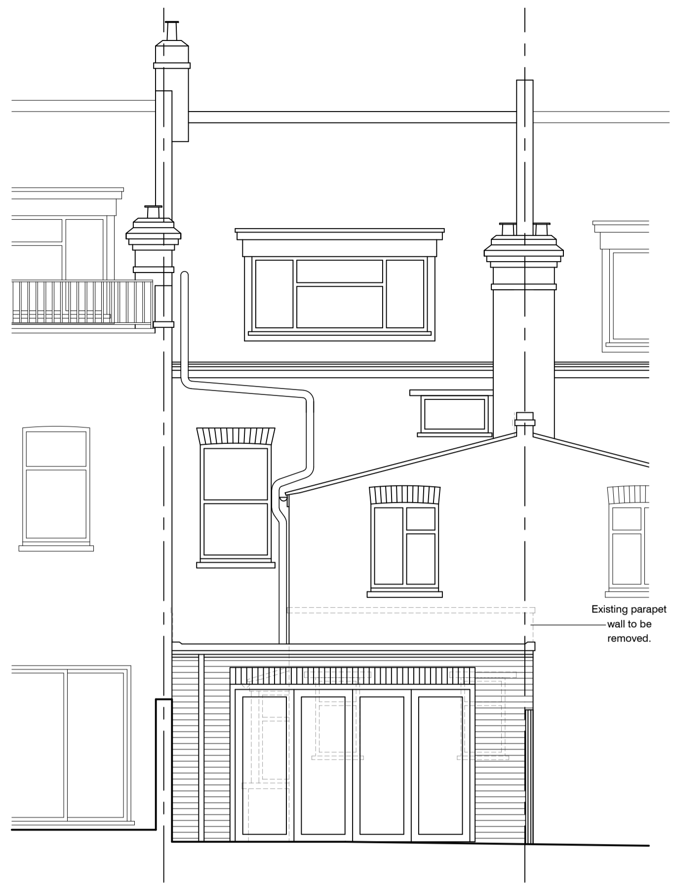
Rear (West) Elevation