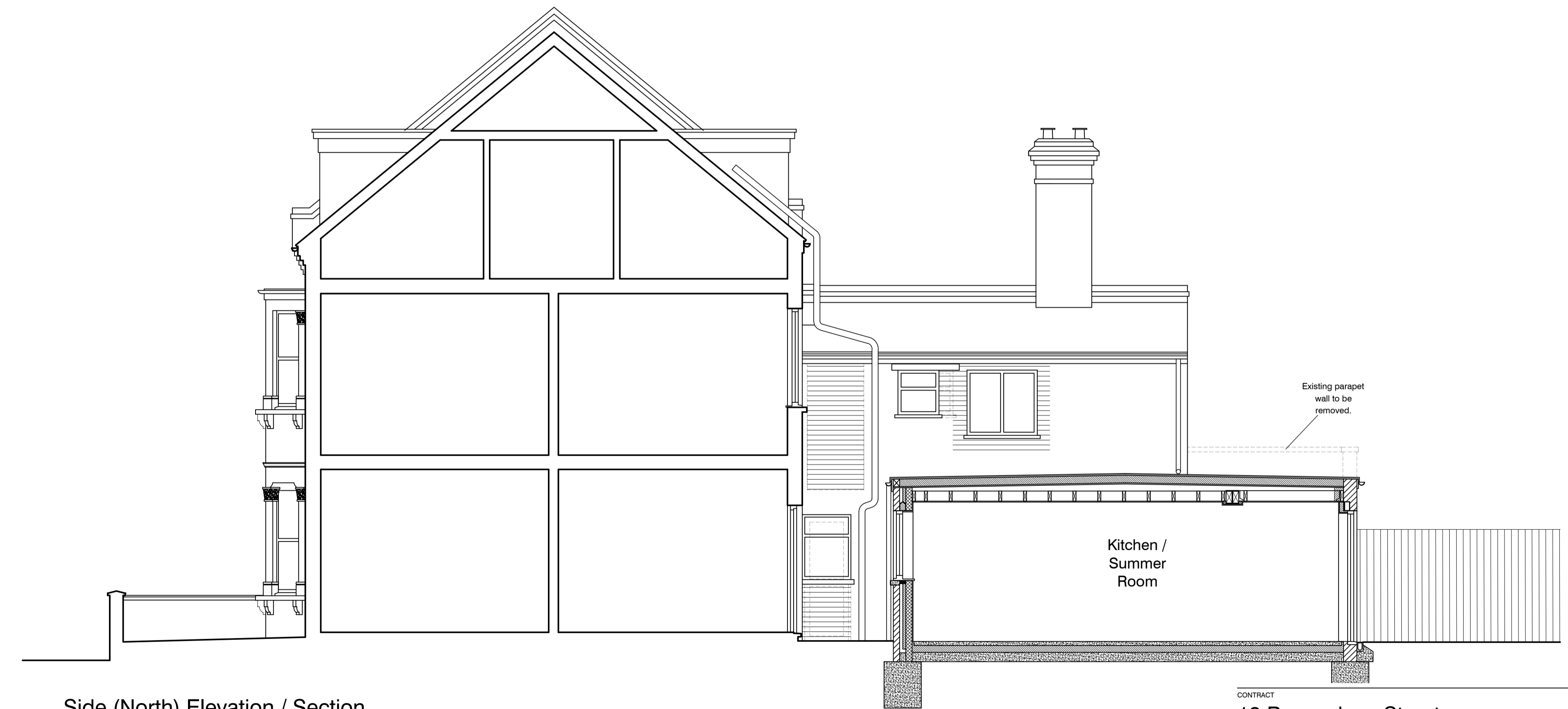
Side (North) Elevation / Section