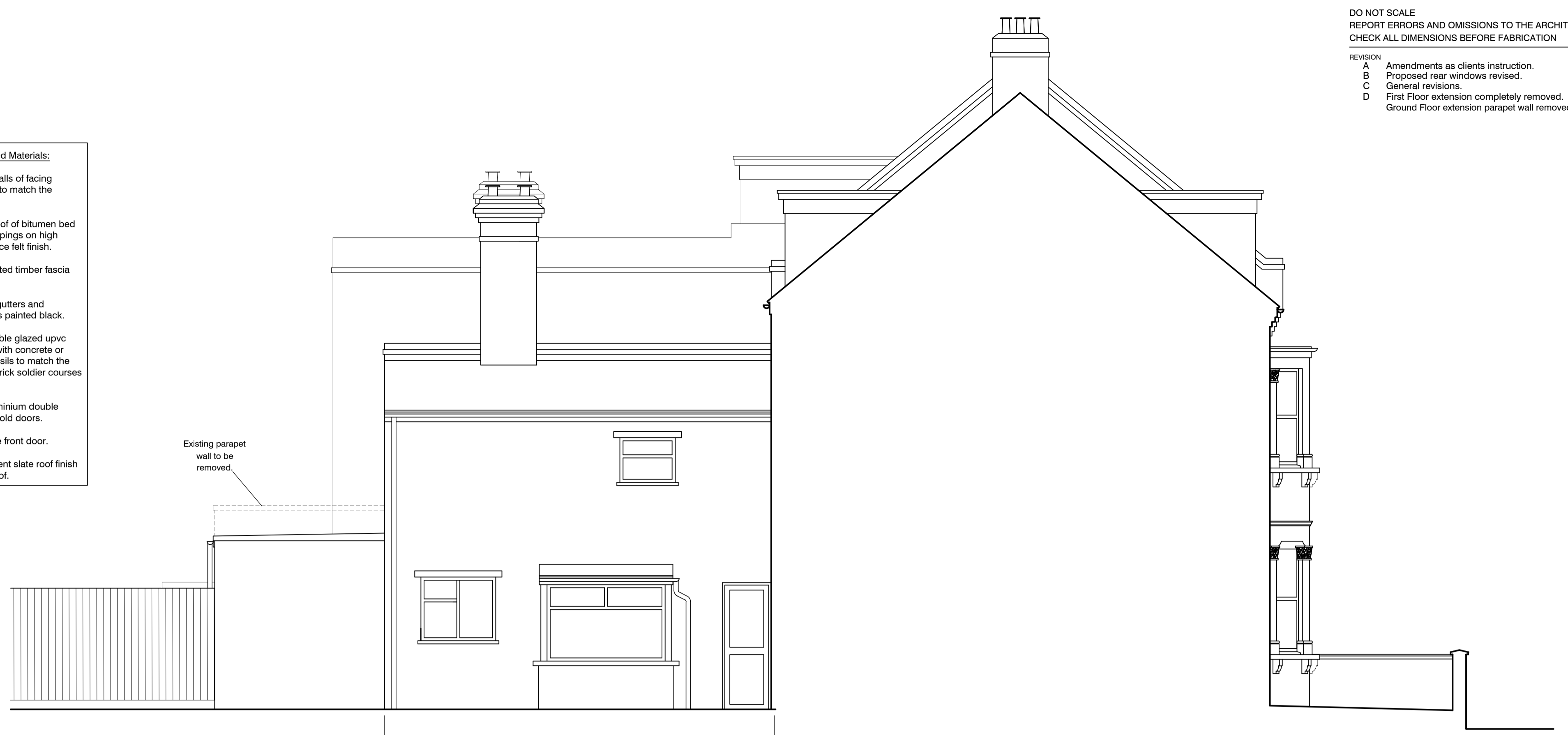
Side (South) Elevation