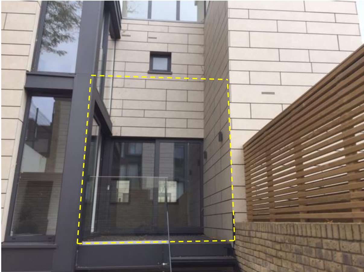
Photo.3 View back towards No.12 indicating area of infill extension.