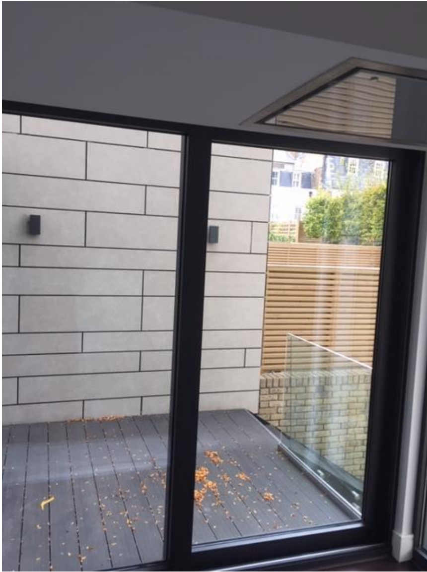
Photo.2 View looking across terrace to be enclosed towards neighbour (No.11). Extension to extend out to glazed balcony.