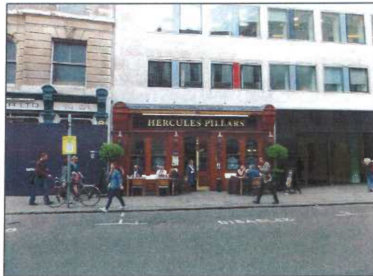
PHOTOGRAPH - B