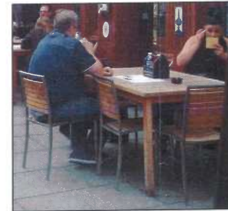
STYLE OF FURNITURE