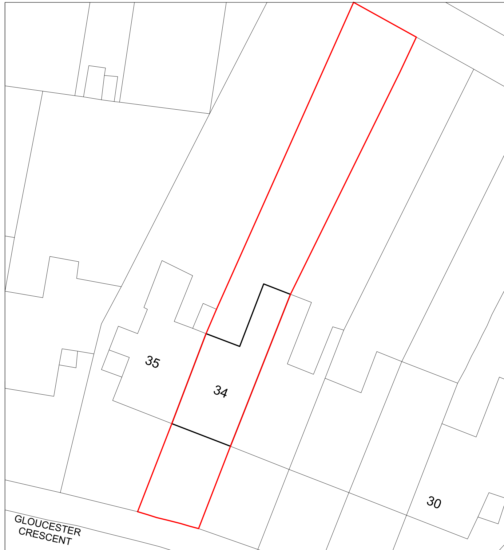
EXISTING SITE BLOCK PLAN- SCALE 1:200