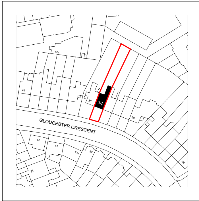
EXISTING SITE LOCATION- SCALE 1:1250