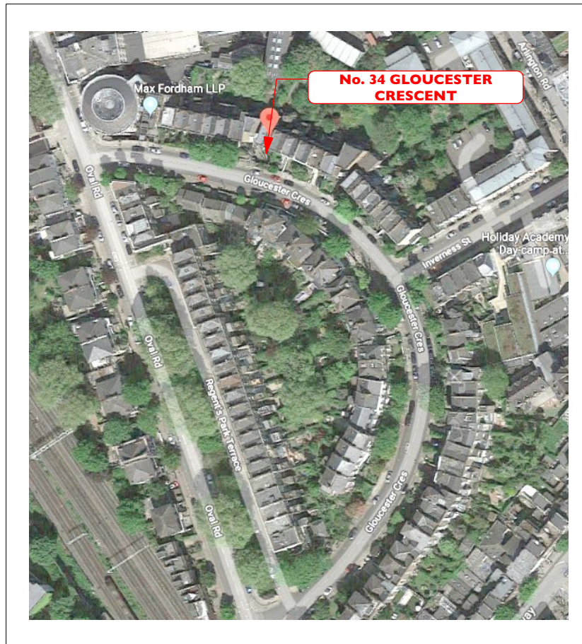
EXISTING AERIAL MAP (NTS)