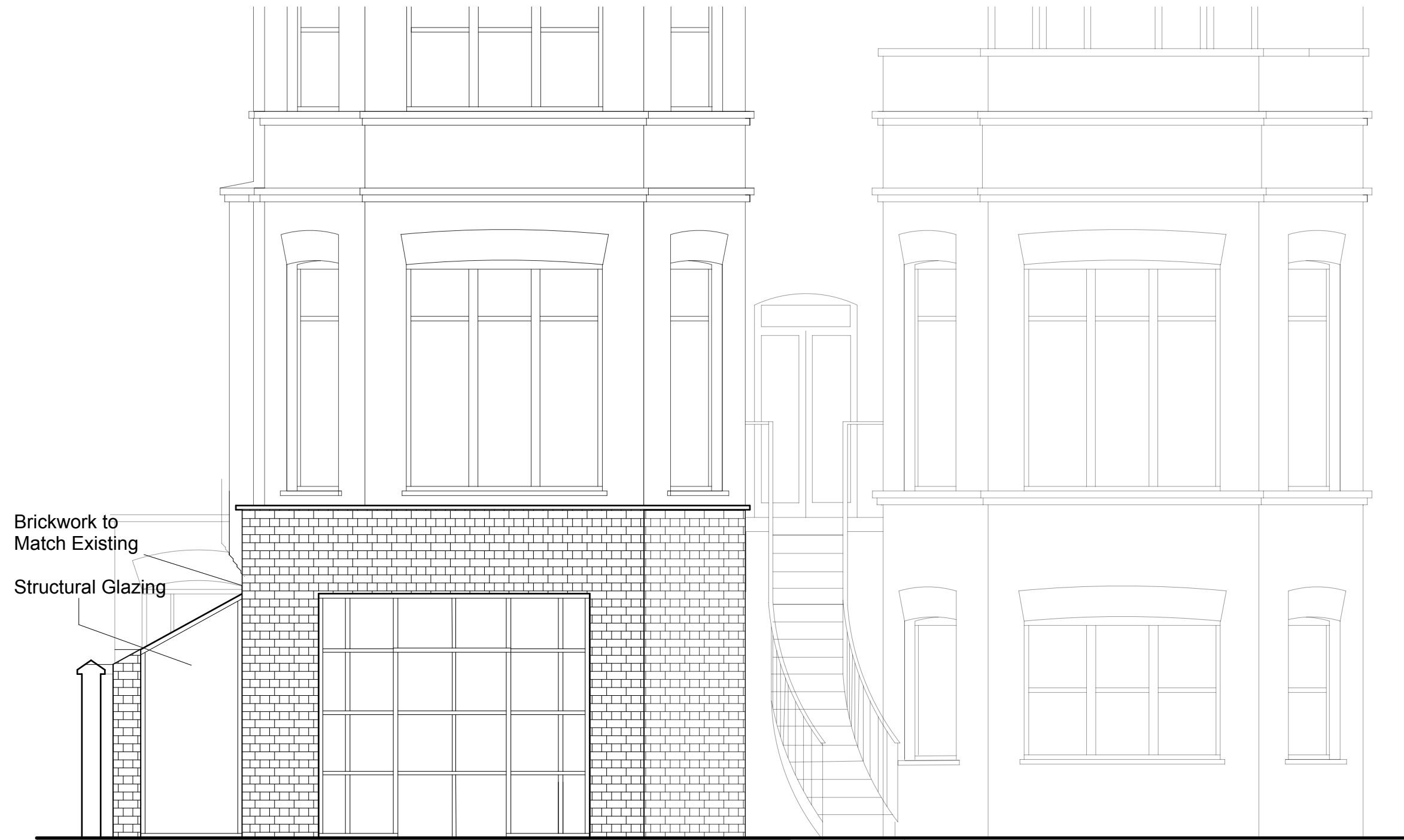
Proposed Rear Elevation in Detail @ 1:50

D Door Changed RB Oct 18 C Section Omitted RB Oct 18